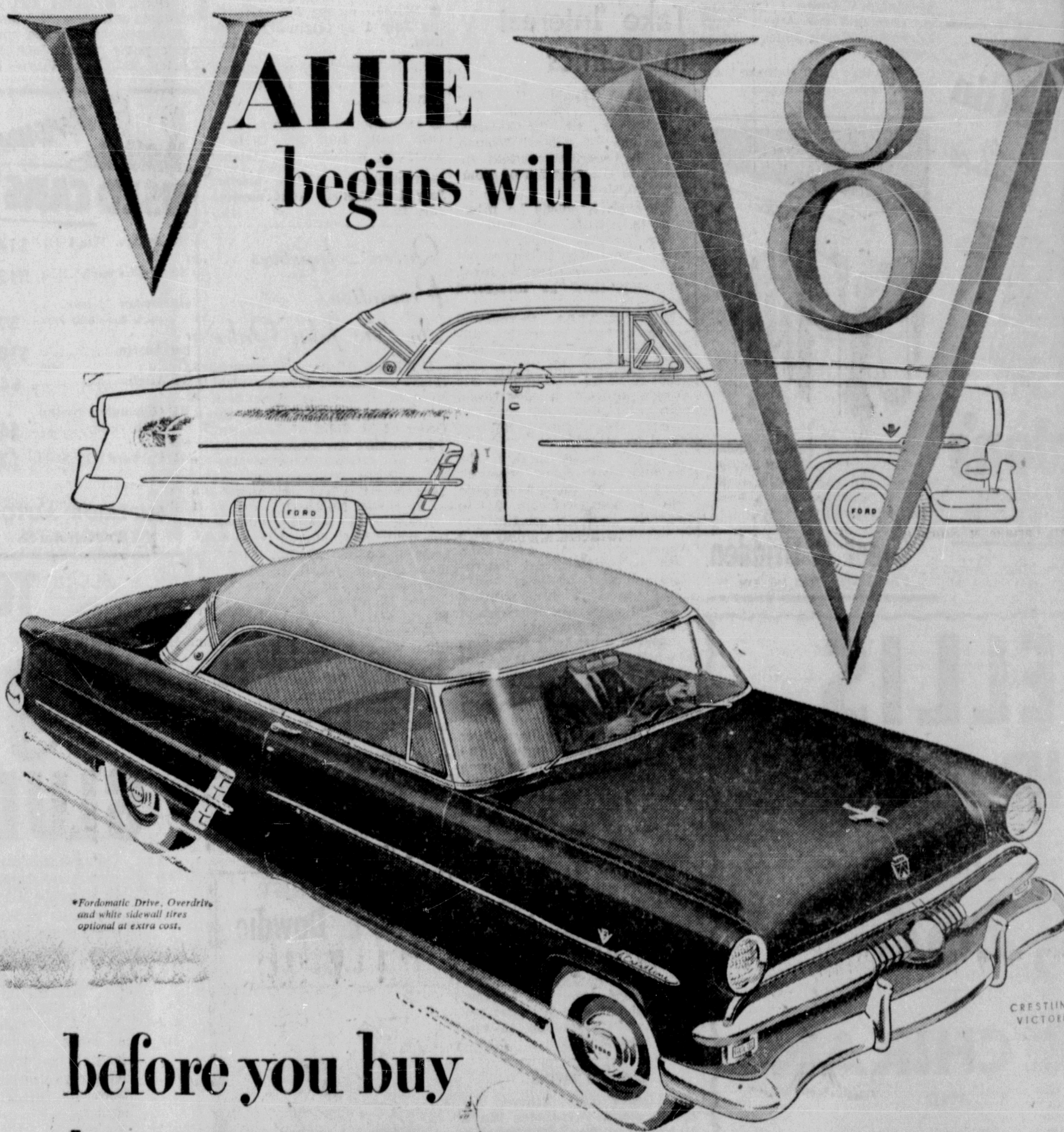
*Fordomatic Drive, Overdrive, and white sidewall tires optional at extra cost.

Improved BCHIS LOWEST COST PROTECTION AGAINST CRIPPLING HOSPITAL BILLS