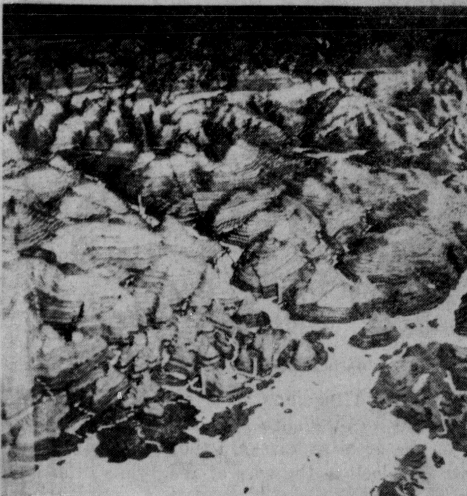
CLOSE-UP OF PRINCE RUPERT area on big relief map in B.C. building at PNE shows Skeena River, centre, with Smith Island and DeHorsey Island at its mouth. Conical shaped island to right of Smith is Kennedy Island. Next large inlet to left is Prince Rupert harbor with Digby Island. To left of Digby is Tsimpsean Peninsula. Layers of plywood used in making map give it a serrated effect. Map has since been painted and completed. PNE runs from August 25 to September 6.

The petition bears more than 7,500 names from all parts of British Columbia.