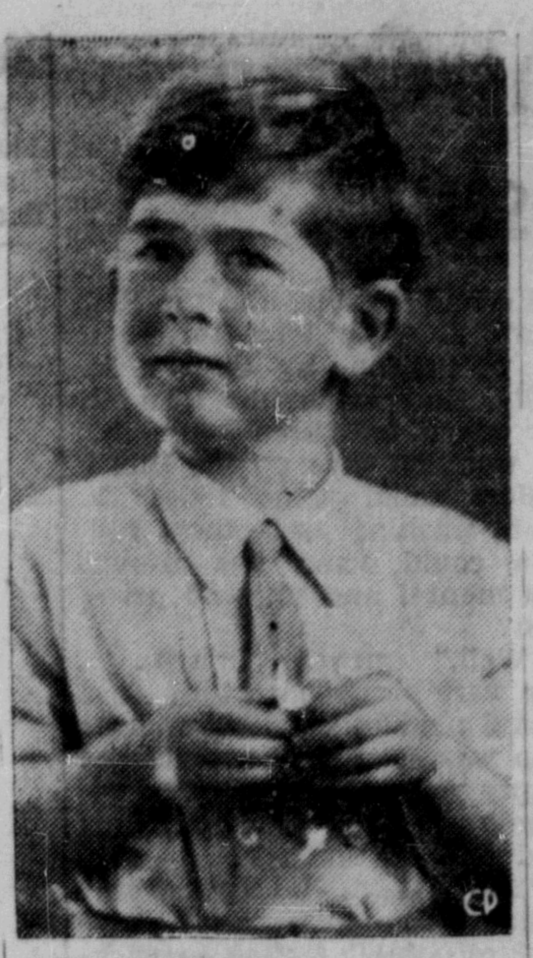
THIS PORTRAIT of Prince Charles was taken for his fifth birthday which he celebrated Nov. 14, a few days before the Queen and the Duke of Edinburgh left London on their Commonwealth tour.

Record Crop Big Poser For Farmers WINNIPEG (CP)—Fears of failure turned to problems of plenty for western wheat farmers in 1953. The early fears centred on a spring drought which posed a threat to the season's growth. But the picture rapidly changed to another extreme with record rains over many areas bringing the third successive bumper grain crop. The country's storage bins already were bulging with 362,000,000 bushels of wheat carried over from 1952 when new grain began pouring from harvester spouts in August. The new crop was estimated at 594,000,000 bushels and Canada was confronted with twin problems: Where to store the grain and where to sell it. With country elevators congested and farm granaries full, many farmers stored grain in open piles in the fields. One grain company estimated 58,000,000 bushels of wheat were piled in the open at one time. At the outset, farmers could deliver only three bushels for each cultivated acre. They collected an initial payment—the remainder to be paid in later instalments as the Canadian wheat board which sells all Canada's wheat, oats and barley, completed marketing. In the crop year ended July 31, Canada regained her position as the world's leading grain and wheat exporter with total exports of a record 582,000,000 bushels. Officials, however, were cautious in forecasting the current crop year's trend.