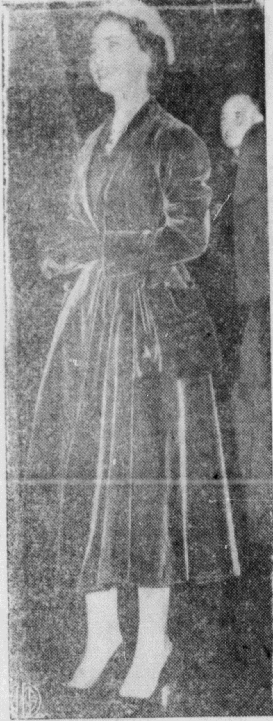
PRINCESS MARGARET'S radiant smile lights up her whole person, as she appears in Manchester, England, for a ceremony at which she officially re-opened the Royal Exchange, seriously damaged during the Second World War.

When it opens, history will have run the cycle and commerce will be back in old Red Square. If the ghost of some czar were to look down from the Kremlin tower he would notice changes but still would recognize the place.