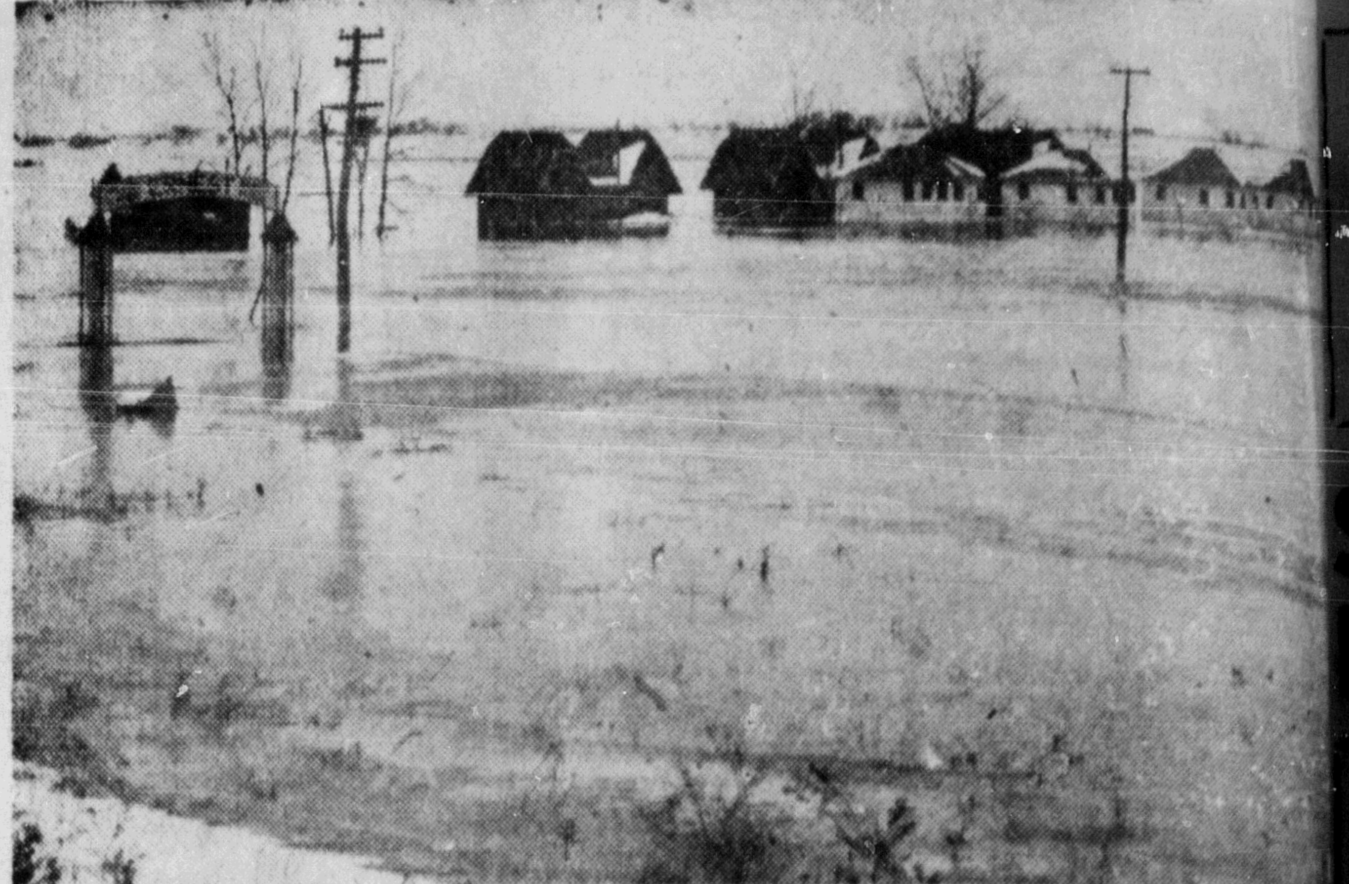
FLOOD WATERS RISE—Unoccupied summer cottages were flooded when the St. Lawrence overflowed the north shore just east of Montreal island. Some families in nearby cottages fled to higher ground but damage was not expected to be extensive.

Co-Operative Wine Growers Association of South Africa, Limited Paarl, South Africa. This advertisement is not published or displayed by the Liquor Control Board or by the Government of British Columbia.