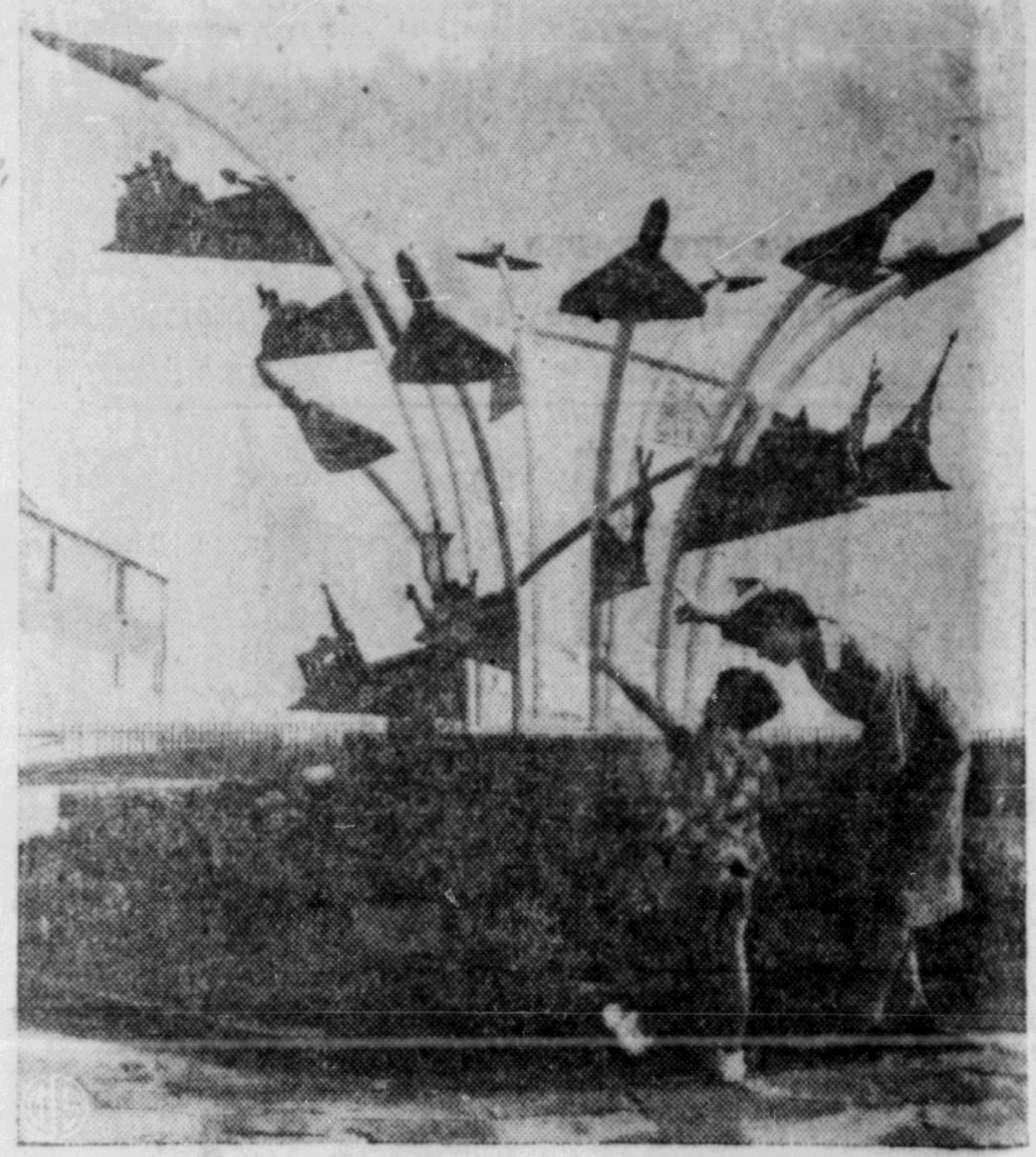
DIRECTIONAL FOUNTAIN —Like a fountain, streamlined jet-plane models shoot into the air from a monument at Frankfurt's Rhine-Main Airport to indicate directions and flying times to world points. Flags show that London is only two hours away from the German city, and that Tokyo, almost in the opposite direction, is just 39 hours away. Note the Statue of Liberty, Eiffel Tower, and other landmarks on the appropriate signs.

By this time there appears to be no question concerning the incidence of cigarette smoking, the state of the lungs and development of cancer. Tens of thousands have ceased smoking. But it must be confessed scores of millions have done nothing of the sort.