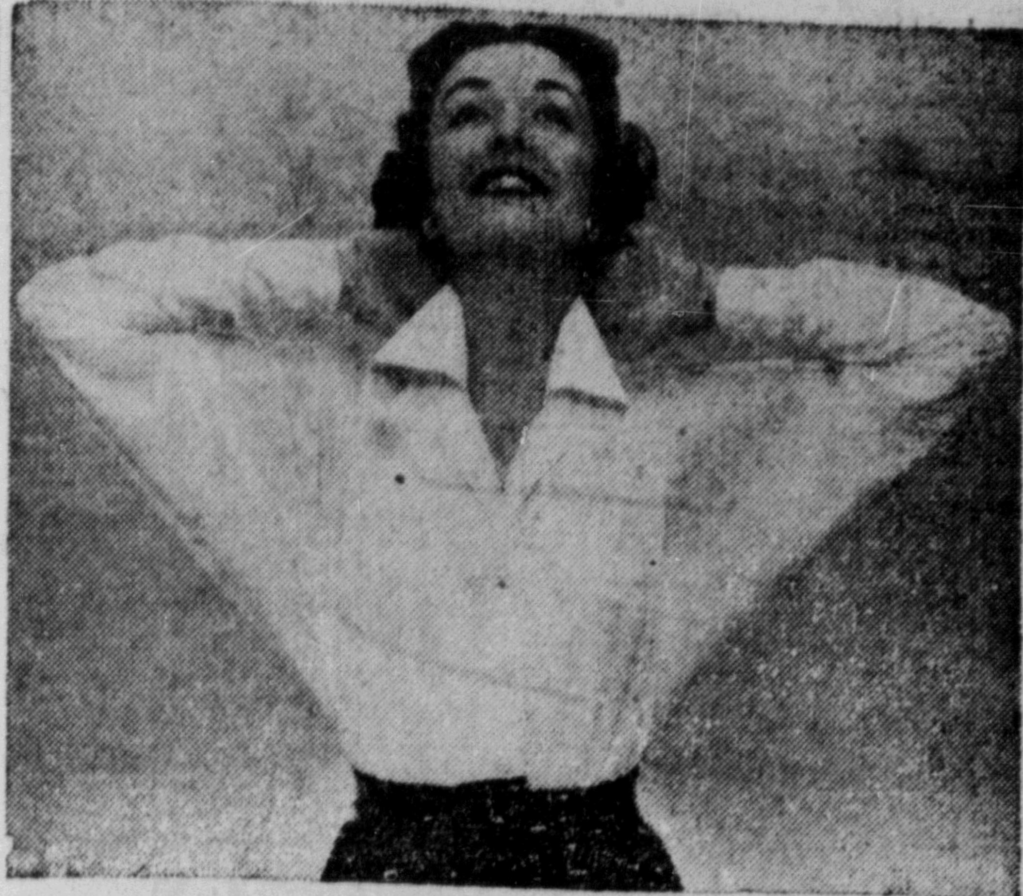
HEAVY NYLON tricot is used in this handsome and comfortable free-action blouse, endlessly useful in any woman's wardrobe. Nylon is a "natural" for a white blouse—washes easily, dries quickly, and needs little or no ironing.

OSLO (AP)—A three-man Norwegian welfare team after 18 months operating a United Nations camp for Korean war refugees returned on a month's furlough. Established under personal supervision of the Norwegians, at the camp on Koleda Island provides shelter for 76,000 refugees.