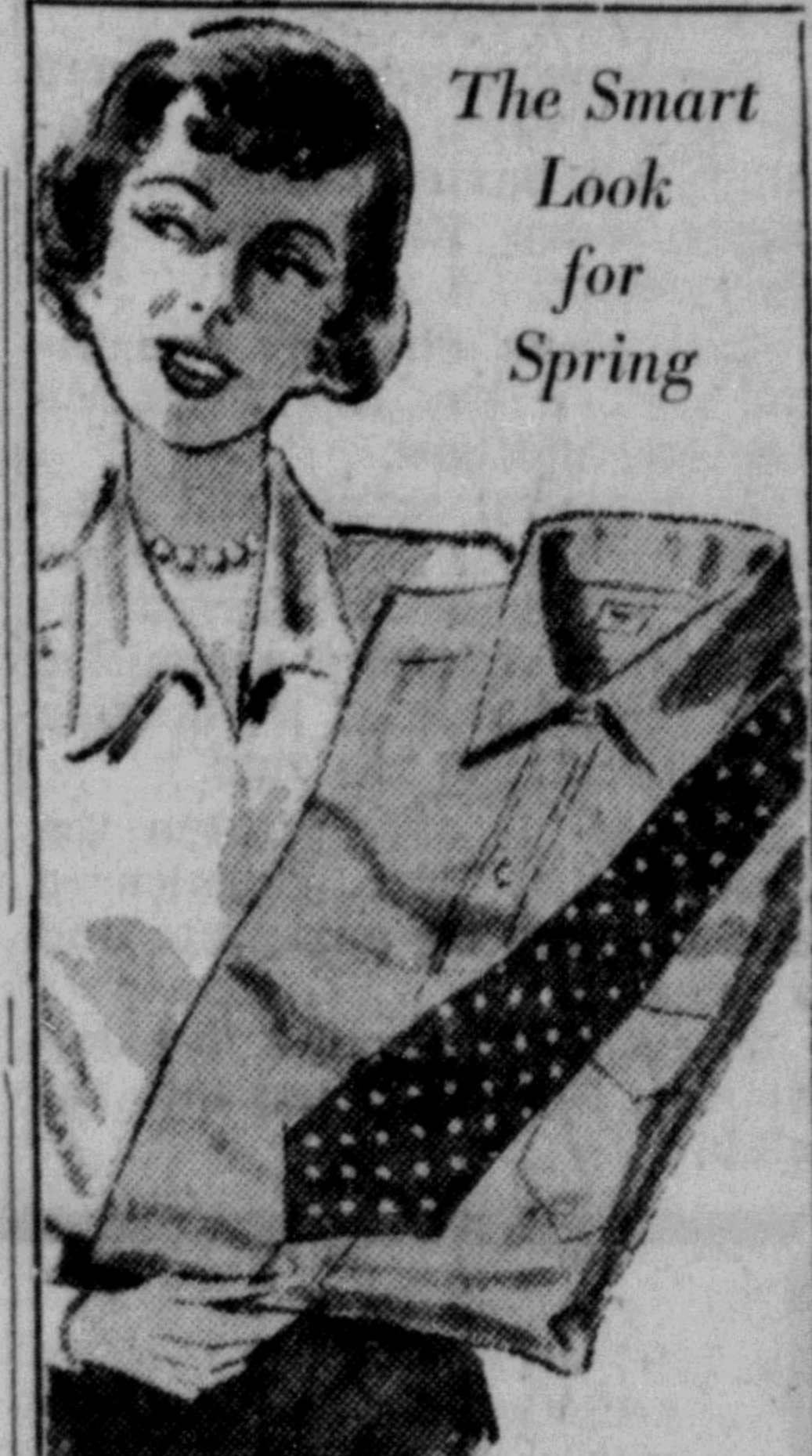
The Smart Look for Spring

Job's Daughters MUSICAL VARIETY SHOW in the CAPITOL THEATRE Sunday, May 24, 9 p.m. Tickets 75c. Get Yours Now