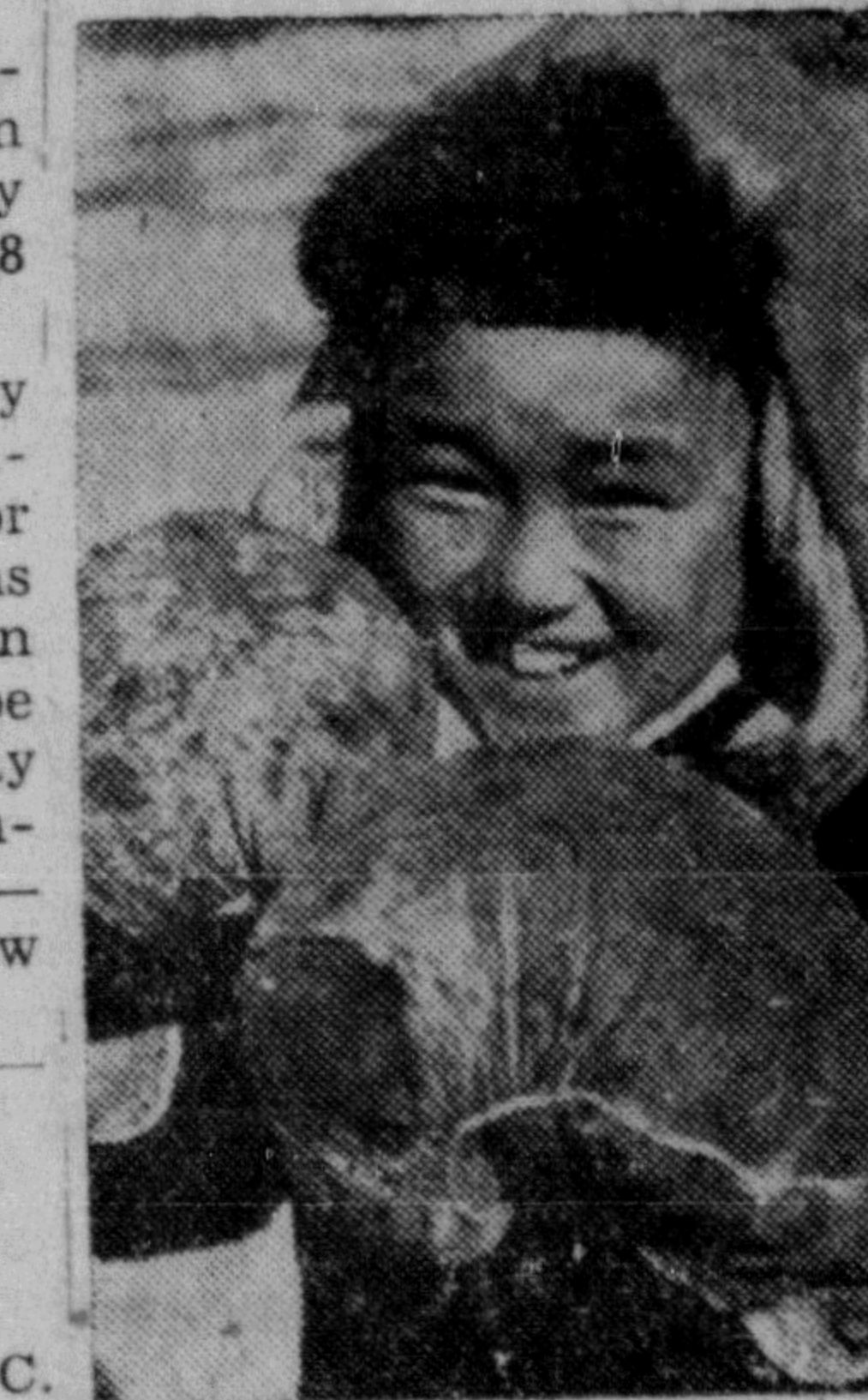
PINT-SIZED PUGILIST — Where he found them nobody knows. This discarded, worn-out pair of over-large boxing gloves is likely his only playing thing. Korean children stay cheerful despite the tragedies of warfare.

"Next time" he added "we may not have eighteen months. Instead of spending millions for airdromes in Europe and guns and ammunition for European nations, this money should be put into trans-Canada highway systems. This should be completed as quickly as possible—as if we were developing a new type of bomber."