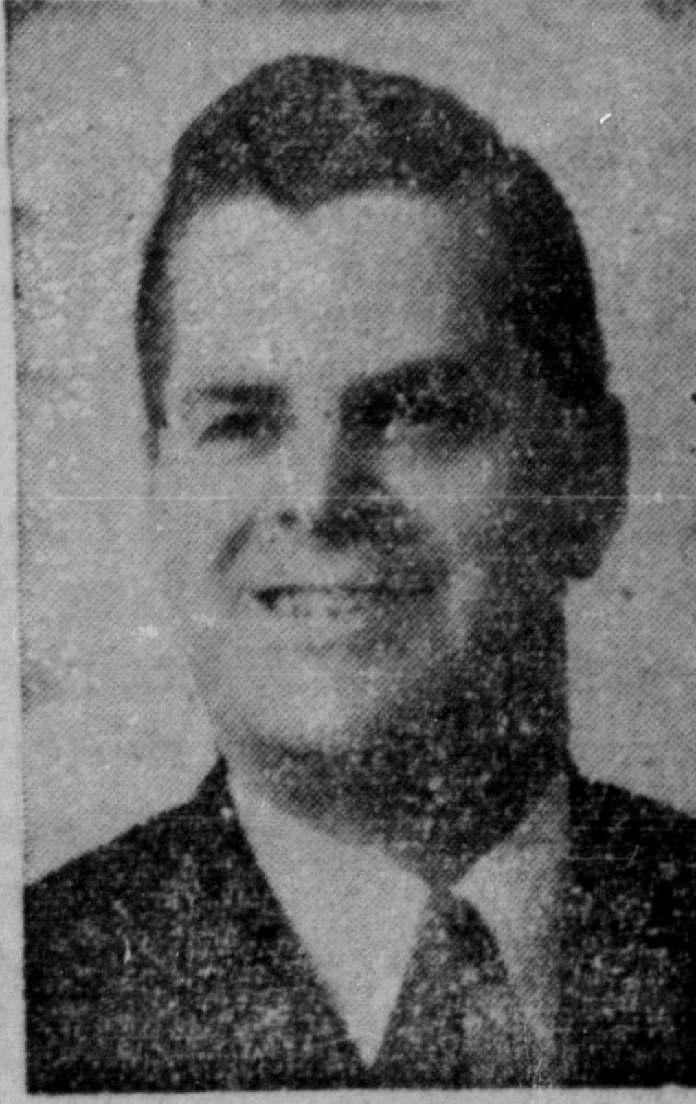
FIRES SALVO W. A. C. Bennett