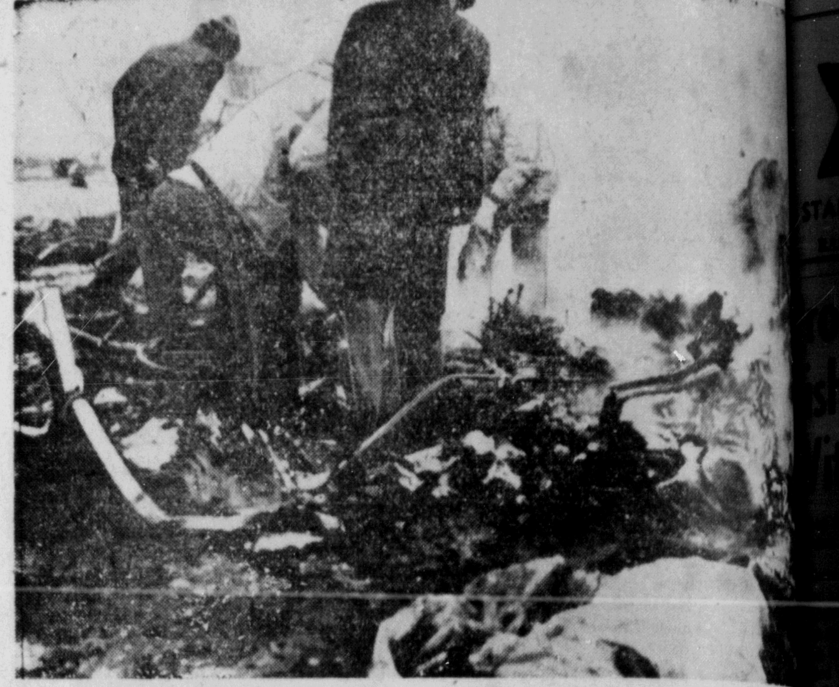
PLANE HIT TOWER —Three airmen were killed when their RCAF training plane crashed into a radio broadcasting tower at Carman, Man. Body of one of the victims, covered by a tarp, is shown in the foreground as searchers probe smouldering wreckage of the plane.

If you want to sell it, advertise it. News classified.