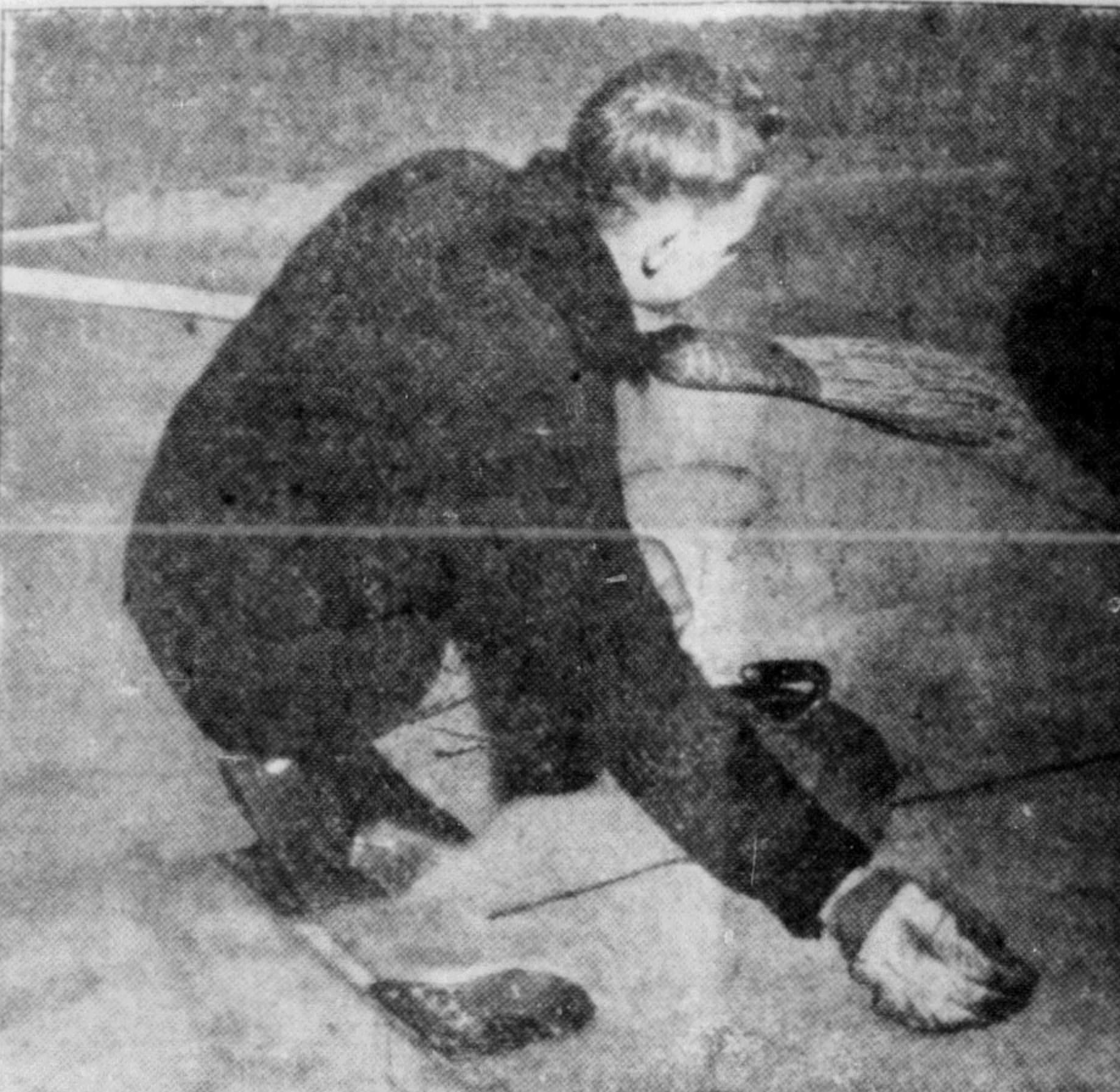
"GIMME THE OTHER TURN!"

Article No. 11 Have you ever had an impulse to yell at your skip, "Gimme the other turn?" Probably you almost choked, trying to swallow your disappointment as you got set for your swing. More than likely your chagrin didn't help your shot any, either. If you are the fellow who has a distinct preference for one turn or another, be careful not to talk in your sleep, because if the skip you play against next game is smart about it, he'll give you such a dose of turns you don't like that you'll feel like breaking your broom over your knees and resigning from the club.