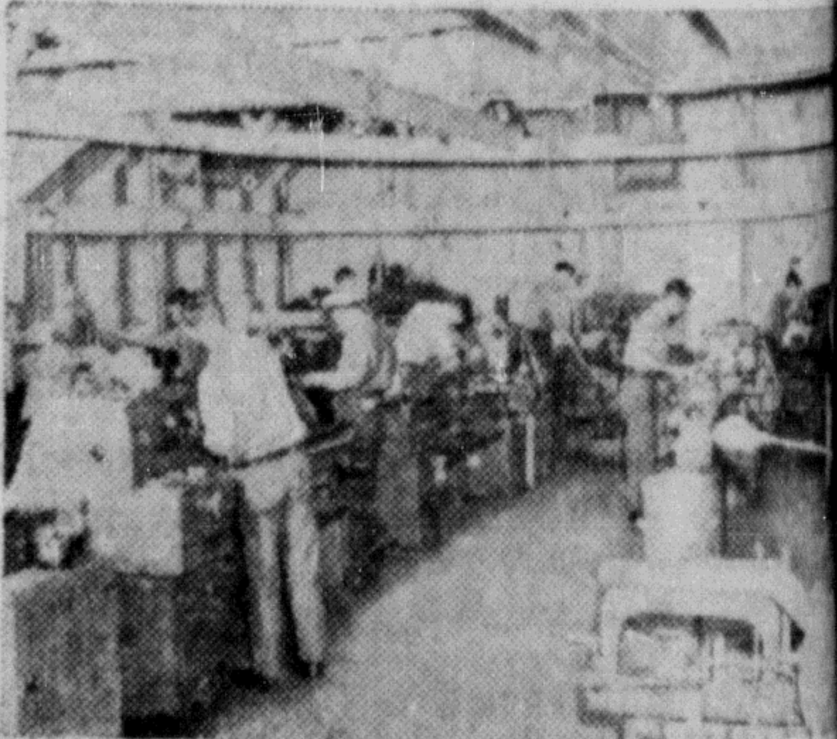
At work in machine shop