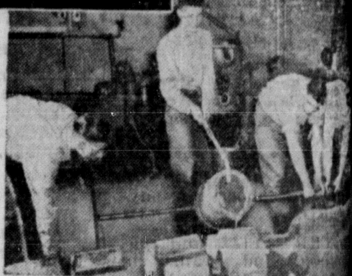
Apprentices in the foundry

Gordon's Stands Supreme TANQUERAY, GORDON & CO. LTD. ... the largest gin distillers in the world