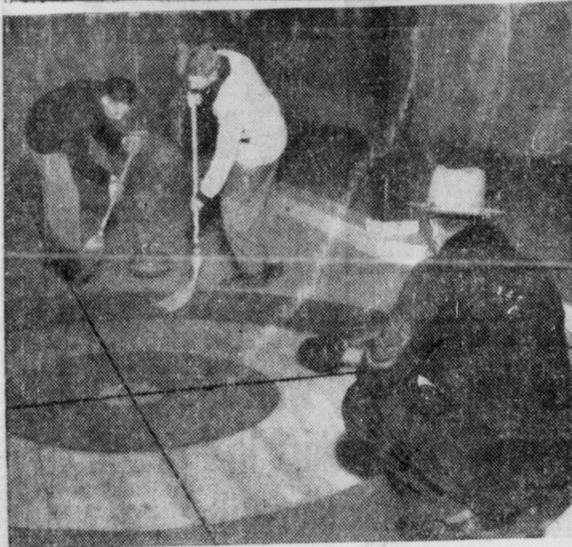
SIZING UP THE ICE

A wily skip knows well that during the first end of a game his real adversary is the ice. Just a few seconds of mind-wandering inattentiveness—a shot mis-directed through giving a player the wrong ice—then the fun begins. You switch from the usual offensive draw game to the desperation of hitting tactics—a few more misses, and presto! Your opponents score a big end. There you are with one end played, three or more points in arrears, and your players still haven't the foggiest conception of what draw-weight is.