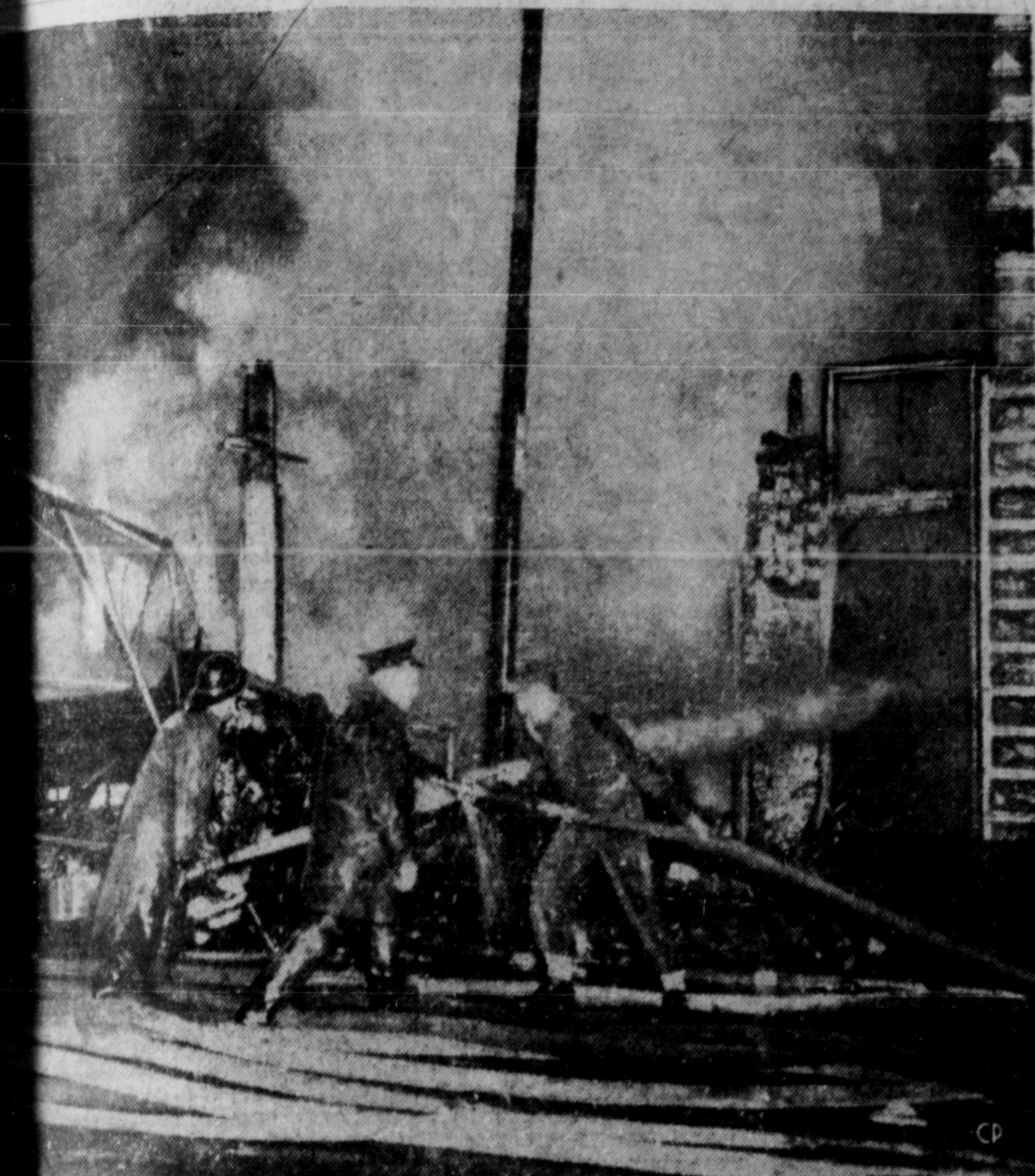
HELESS—A seven-hour $750,000 fire last week destroyed five buildings at the main of Belleville in the worst fire in the eastern Ontario city in 35 years. Nearly half of 22,000 people witnessed the blaze. Only person to suffer injury was Fire Captain Joe suffered hand cuts. Seventy-five firemen and volunteers from three brigades fought freezing sleet storm to bring the fire under control.