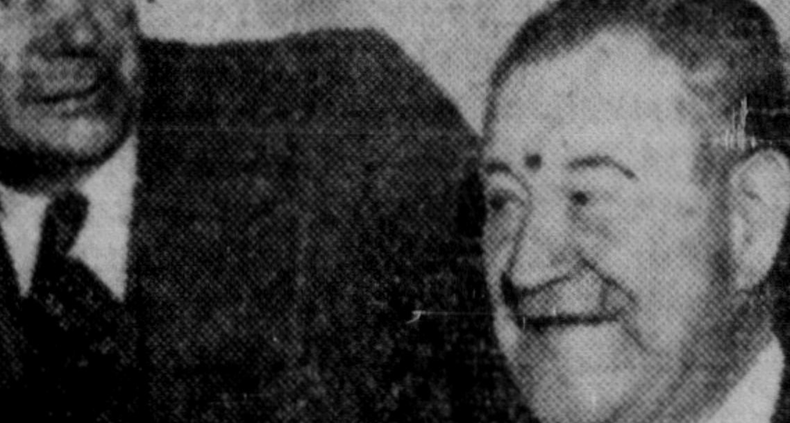
TRIO OF CHAMPS — Bobbie Rosenfeld, left, rated Canada's outstanding woman athlete of the half-century, chats with Lionel Conacher, Canada's outstanding male athlete of the half-century, and his American counterpart, Jim Thorpe, right. All three attended the Ontario Sportswriters and Sportscasters first annual celebrity dinner in Toronto.

Edmonton Mercurys defeated Sweden, the European hockey title holders, Saturday night by a score of 5 to 2. Fifteen thousand persons saw the game.