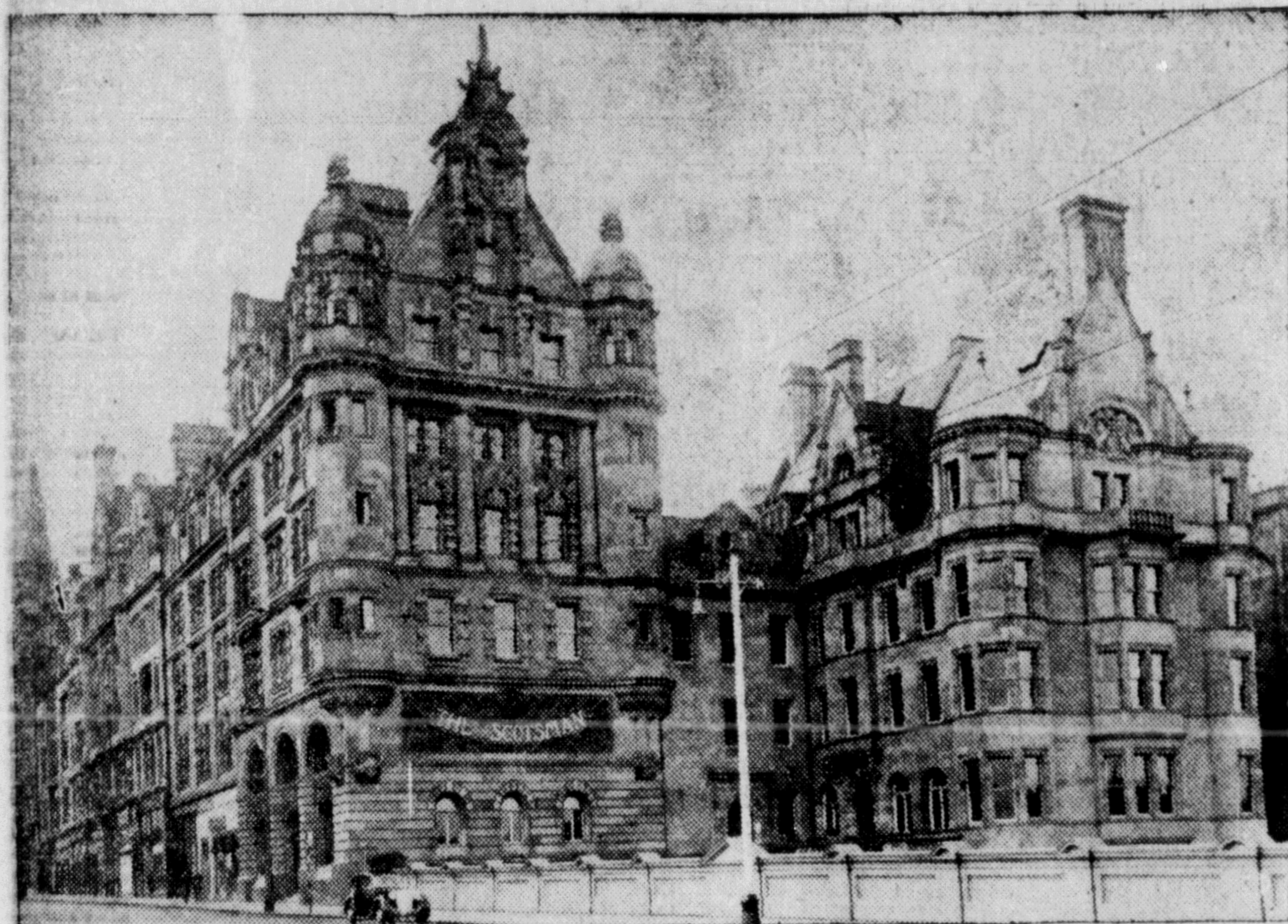
CONTROL OF EDINBURGH SCOTSMAN , one of the oldest newspapers in Britain, has been purchased by Roy H. Thomson of Toronto, president of the Thomson Company, Limited. Mr. Thomson was named chairman of the board of Scotsman Publications, Limited, which operates The Scotsman, The Evening Dispatch and The Weekly Scotsman. The Scotsman was founded in 1817.