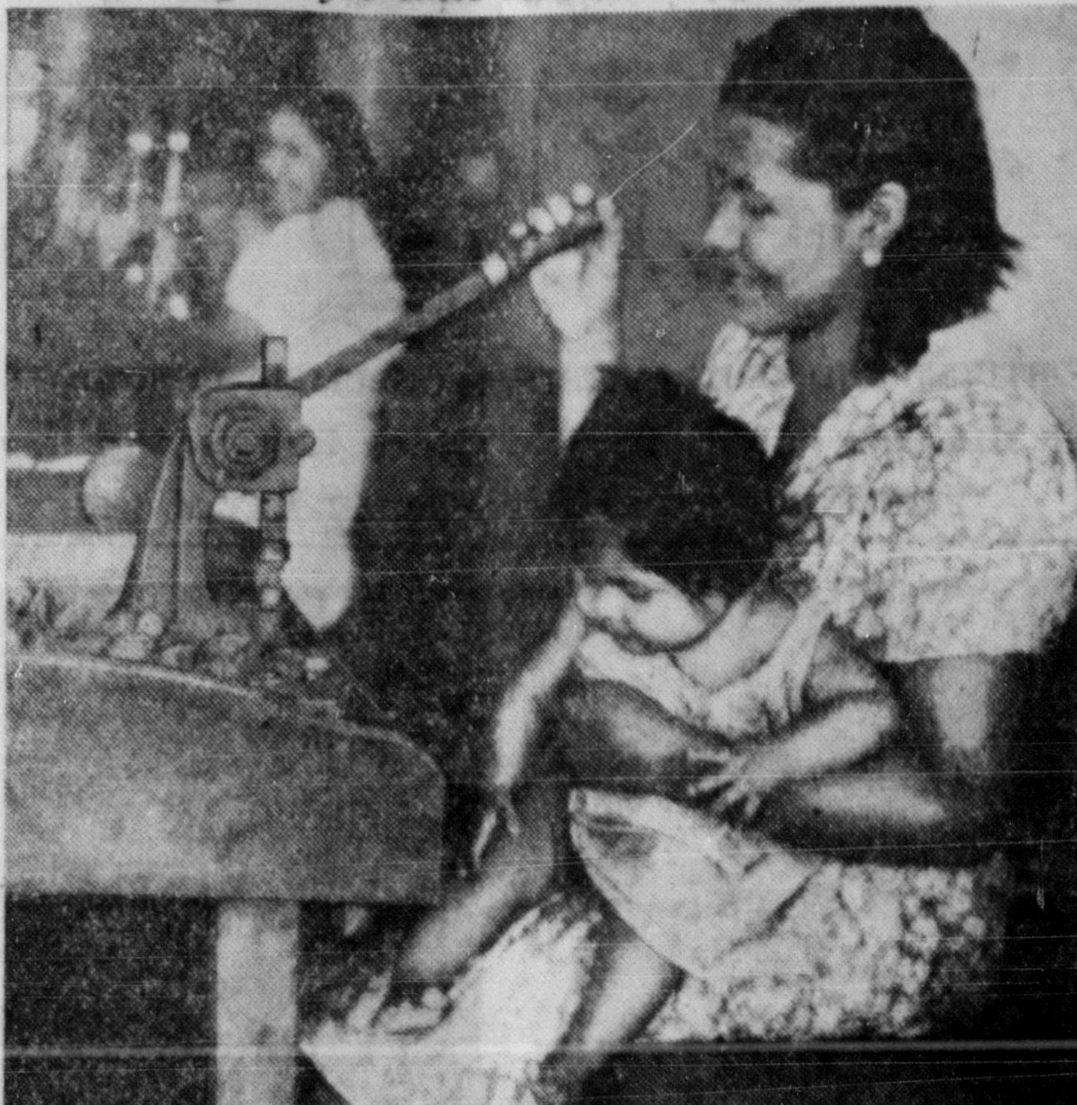
A proposal to grant at least 12 weeks maternity leave before and after confinement to women workers in industry, commerce and other non-manual jobs will be considered by government, worker and employer delegates at the general conference of the International Labor Organization (ILO), next June.