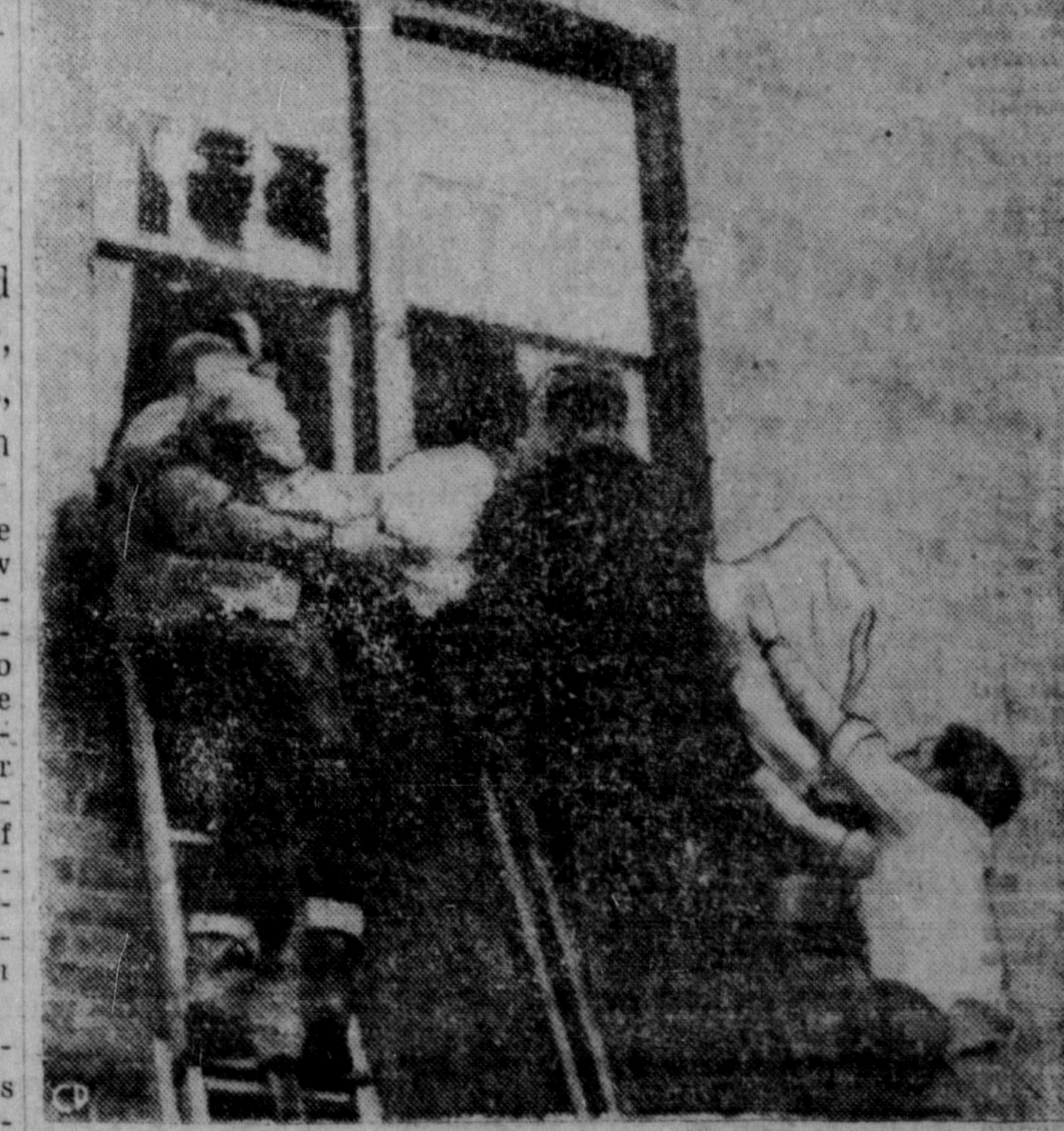
RESCUE ELDERLY PATIENT—An elderly patient—one of 27 rescued—is carried down a ladder from the Brierbush private hospital at Stouffville, Ont., 20 miles northeast of Toronto. The patients, many crippled and more than 80 years of age, were carried out by nurses and firemen when fire, which originated from defective wiring in the basement, caused an estimated $10,000 damage to the building. The patients will be housed in private homes until repairs are made to the hospital.

Thursday, April 3, 1952 High 7:53 15.9 feet 21:41 15.4 feet Low 1:45 11.6 feet 14:52 7.5 feet