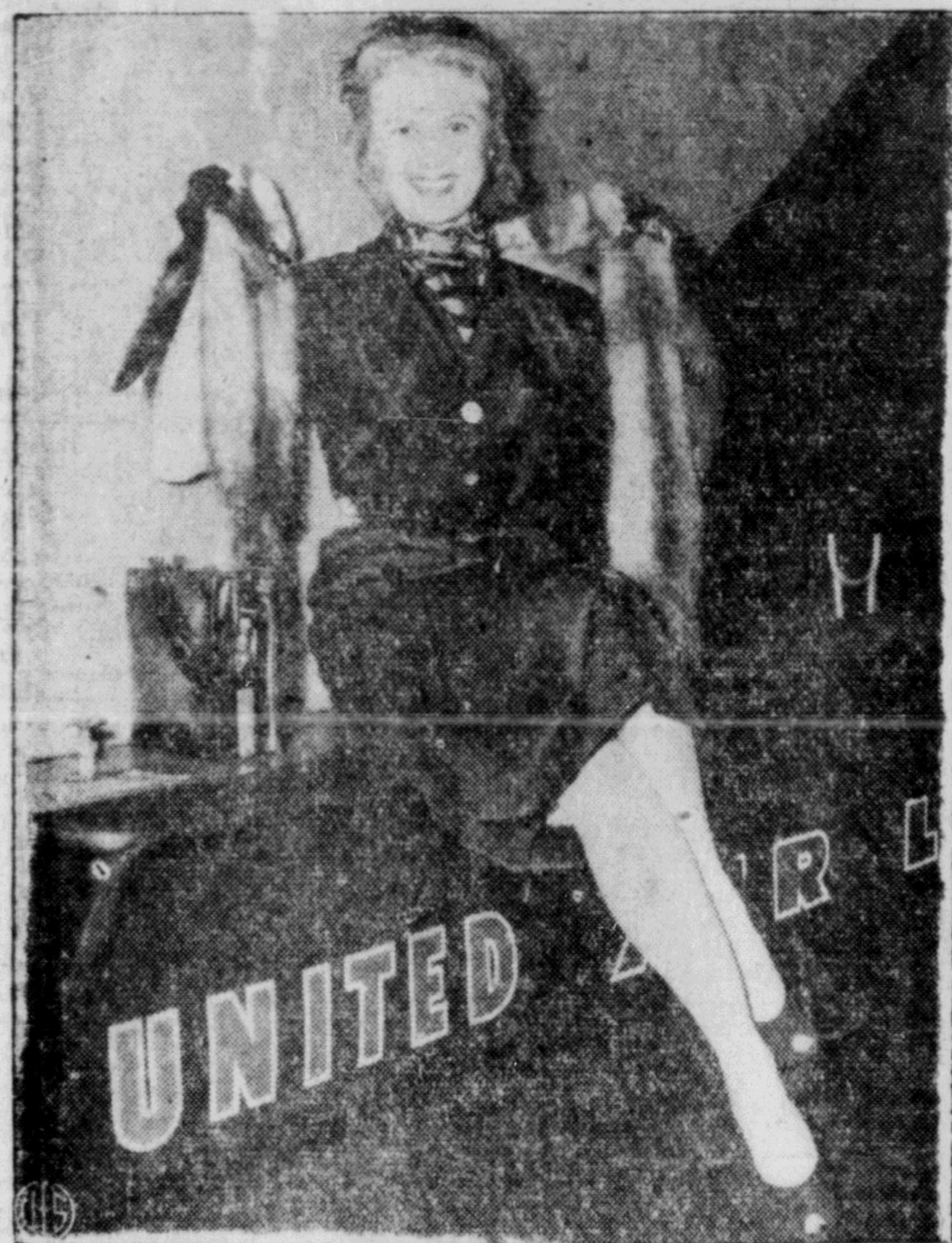
STAGE AND SCREEN STAR JOAN CAULFIELD is shown as she arrived in New York from Hollywood in preparation for her plunge into television as the star of her own comedy series, "My Favorite Husband," which begins in September on the CBS network.