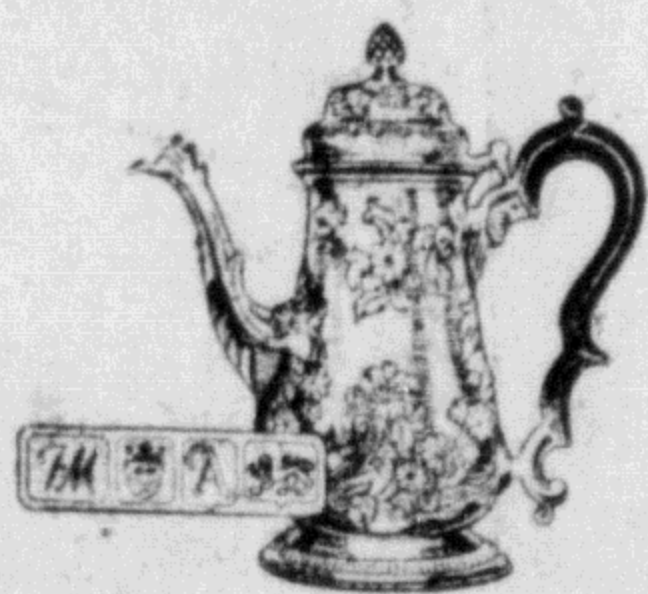
A sterling silver coffee pot by Thomas Moore, England, 1757. A refined piece, now in the O. B. Allan collection, Vancouver.