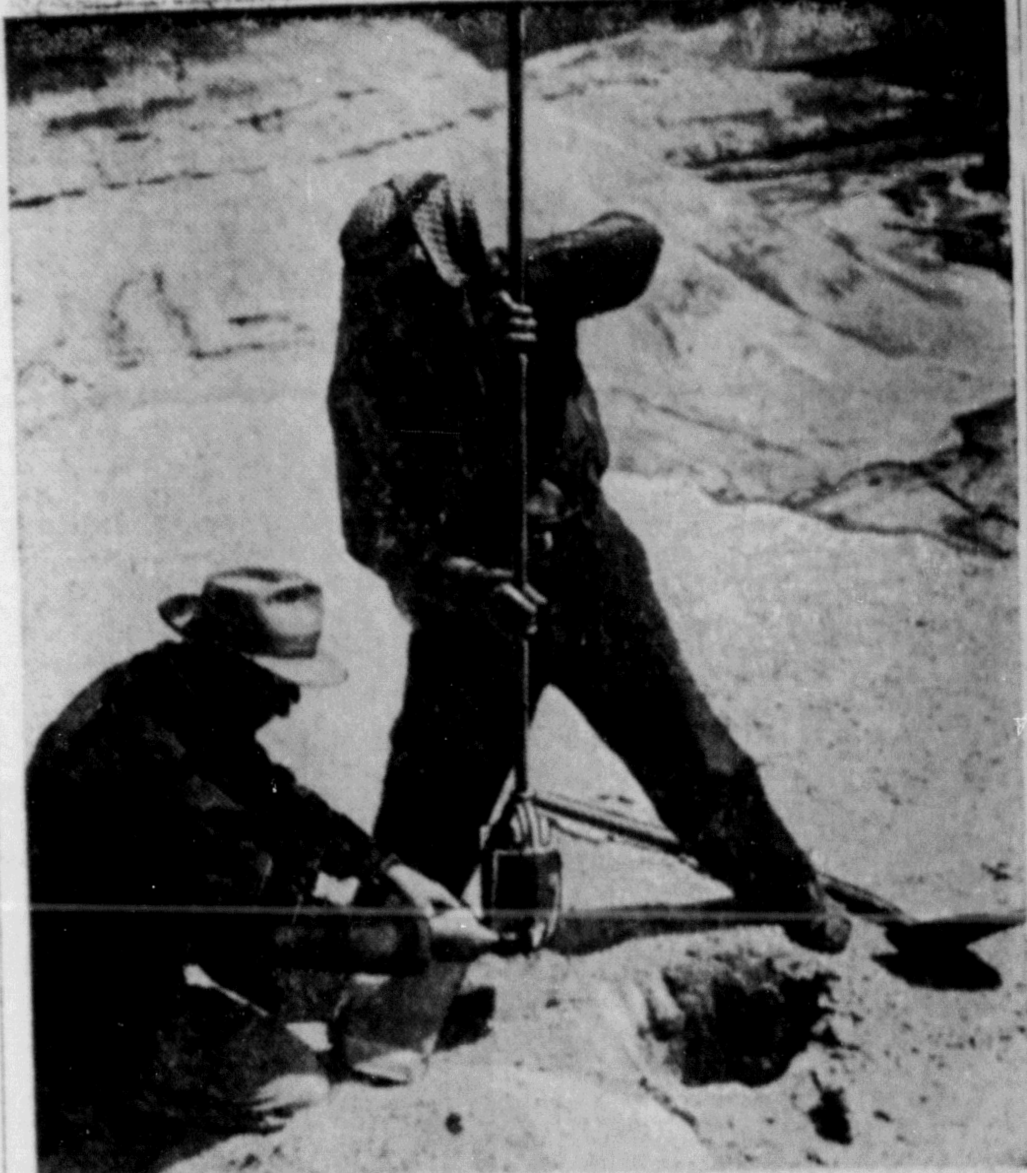
EXAMINING SOIL SAMPLES in the Jordan Valley, a water development expert (left) gathers data on irrigation possibilities. The United Nations Relief and Works Agency for Palestine Refugees recently agreed with the Kingdom of Jordan to provide $40,000,000 for construction of an irrigation and power dam in the region. The dry land, given water, might support up to 20,000 refugee families.