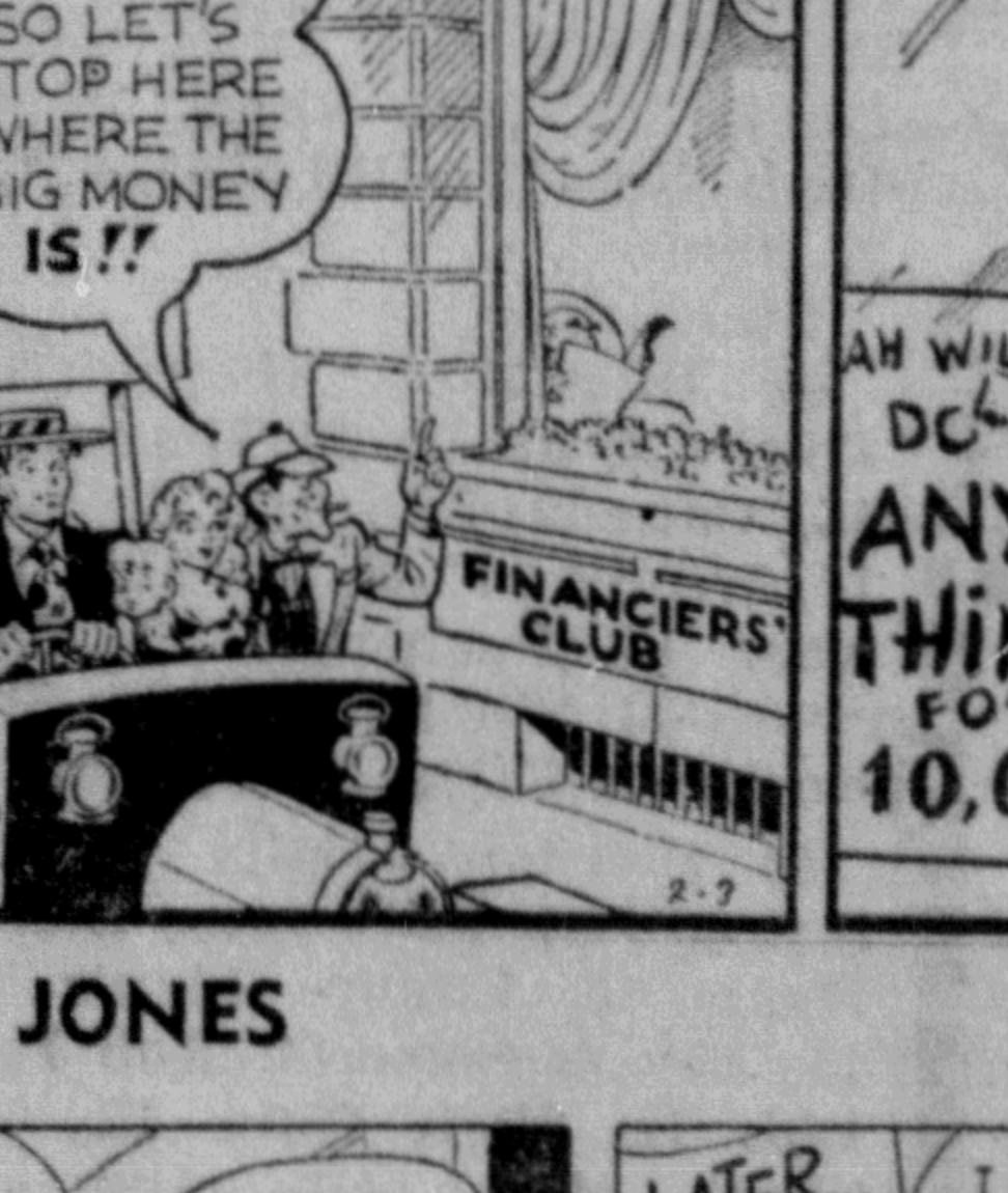
By STAN DRAKE