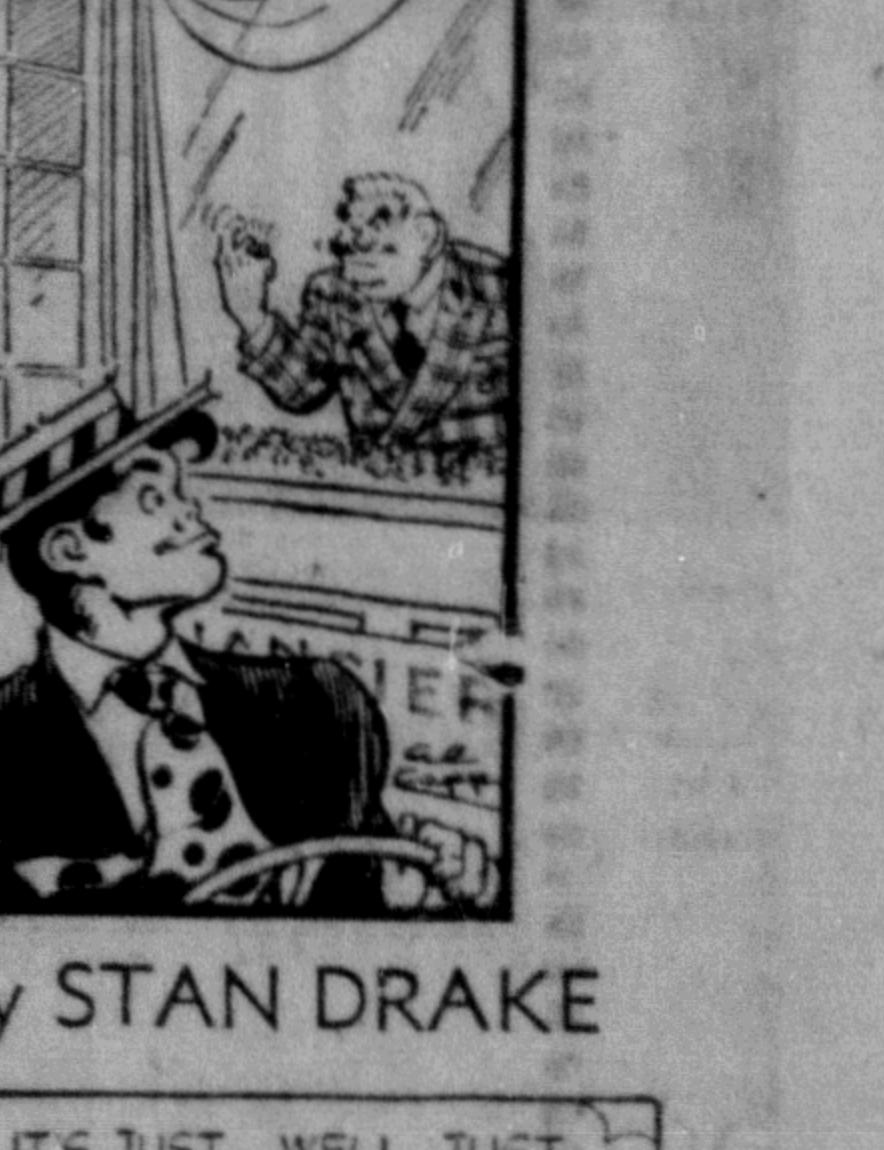
By STAN DRAKE