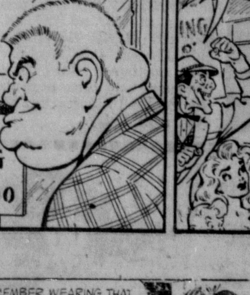
By STAN DRAKE