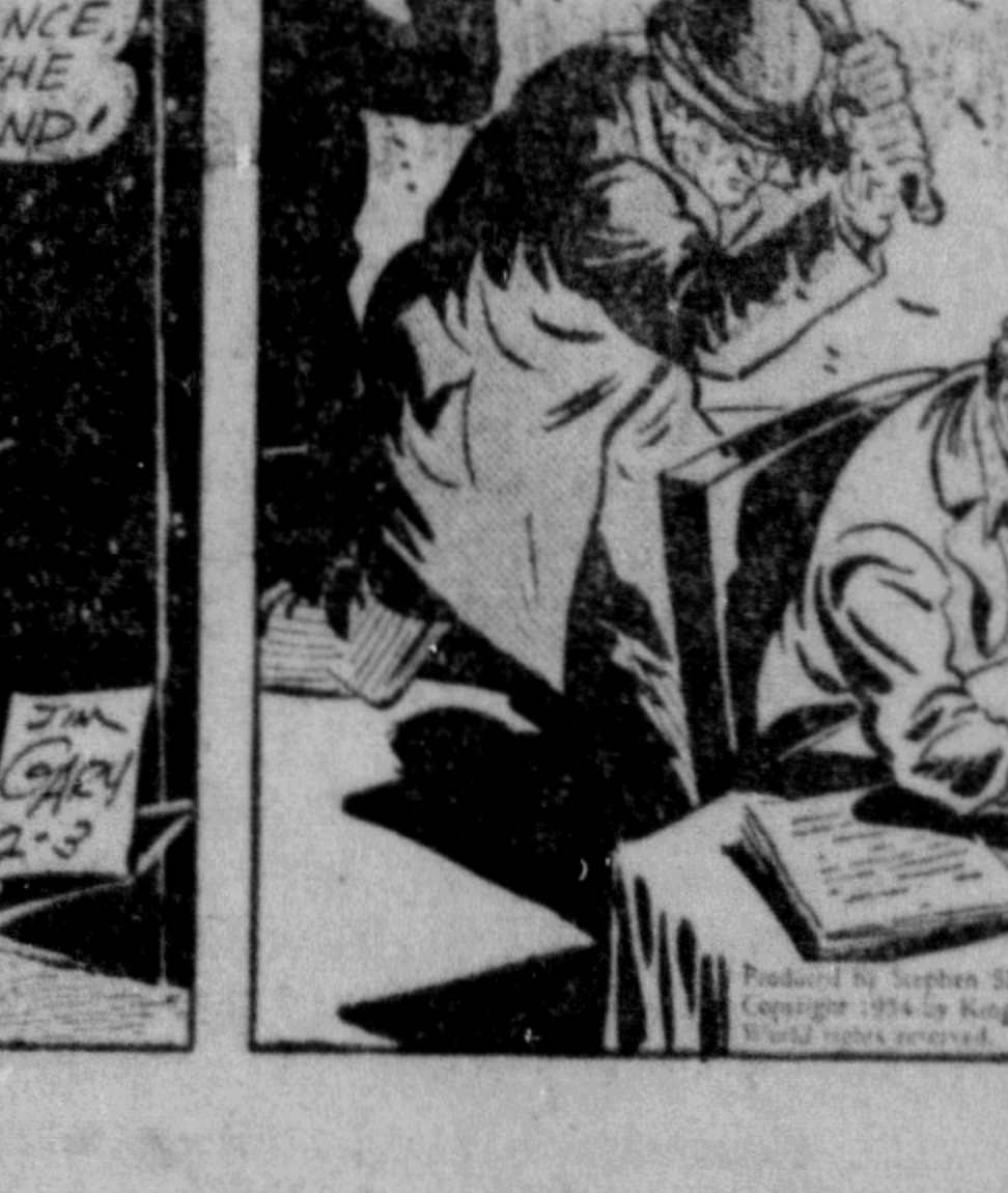
THE HEART OF JULIET JONES