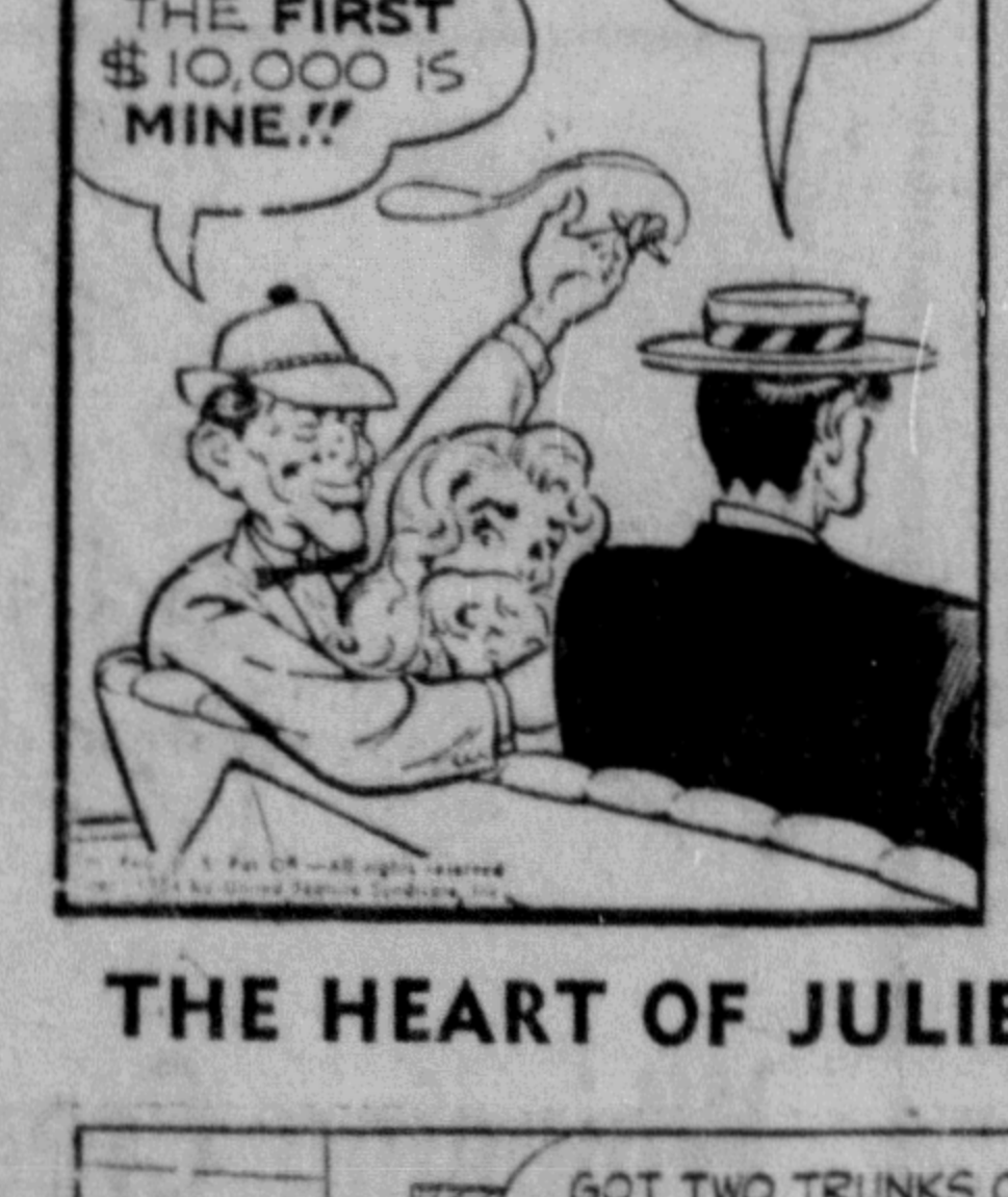
By STAN DRAKE