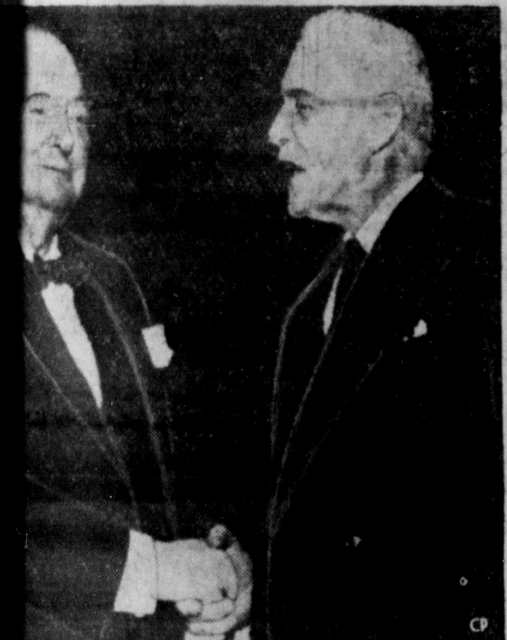
PRIME MINISTER CHURCHILL (left) shakes hands with Prime Minister St. Laurent at the door of 10 Downing Street, following a meeting Saturday. The Canadian prime minister made his first stop on his world tour. Appearance of the British prime minister was a source of rumors that he had had a slight stroke.