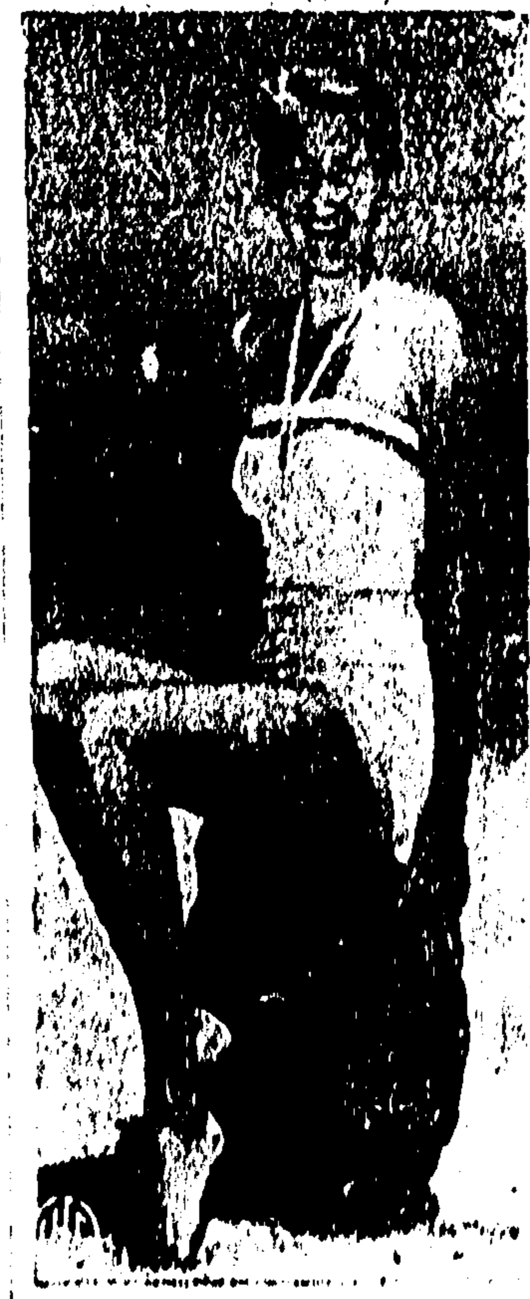
A FAIR VISITOR to the Bahamas, beach picks what appears to be a gnarled old rock as a perch to pose for a snapshot, unaware that the "rock" is worth its weight in greenbacks. Upon closer inspection it proved to be a 125-pound chunk of ambergris, a rare and valuable substance found in the intestine of the sperm whale. It was found lying on the beach.