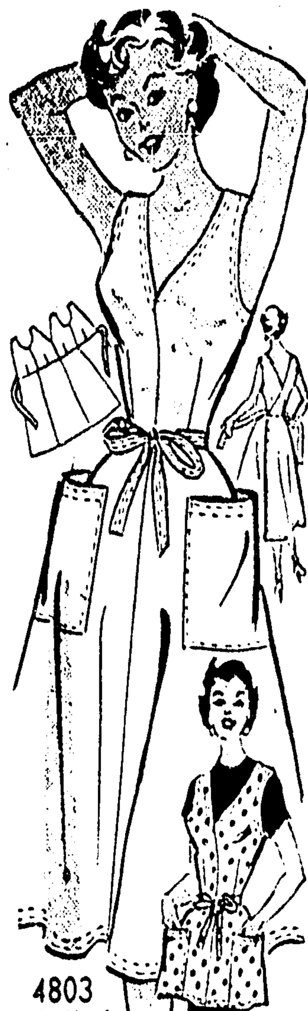
4803 by Anne Adams

Two dresses to her wardrobe! Sew only ONE! This dress sundress for your hard-playing little pet becomes an angelic Sunday frock in a jiffy. Just button on that frilly collar. Pattern for bonnet too! They're sew-easy! Pattern 4762: Children's Sizes 2, 4, 6, 8, 10, Size 6 frock, 1 1/2 yards 25-inch; 3 1/2 yard contrast; bonnet, 1 1/2 yard; 1/2 yard contrast. This pattern easy to use, simple to sew, is tested for fit. Has complete illustrated instructions.