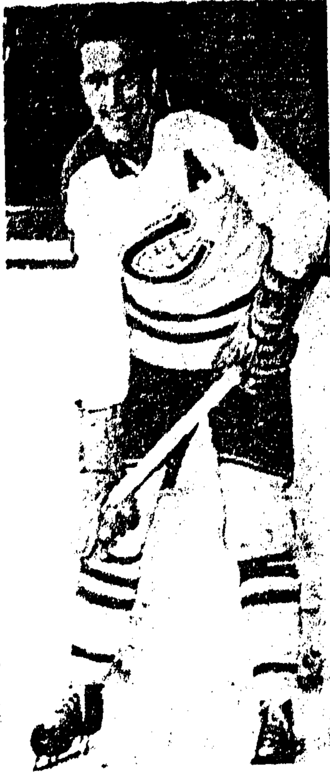
BERNIE GOEFFRION Tied For Lead

Canadiens went back to Bernie (Boomer) and Gordie to keep up his scoring pace. The Boomer bagged two of his team's goals Tuesday night and can hit total for semi-final and final to eight, putting him in a tie for the play-