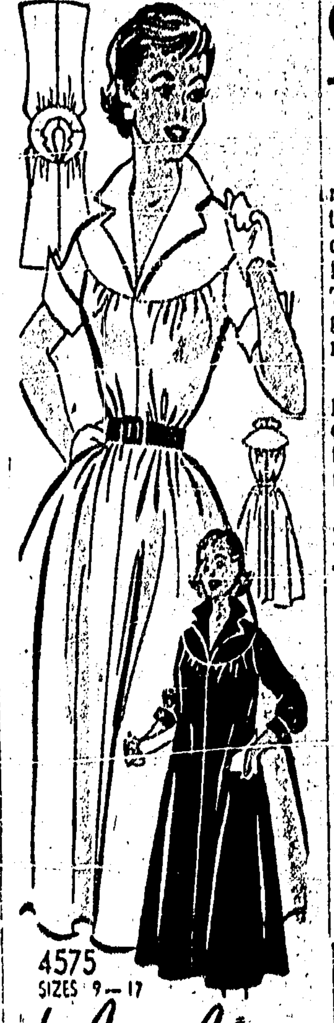
4575 SIZES 9-17 by Anne Adams

BEGINNER-SIMPLE to sew — no waistline seam! Just sew this flattering deep-yoke dress right away! Your favorite style, with softly bloused bodice, whirl skirt. Cinch the waistline with a smart belt — you're fashion-right and ready for any occasion!