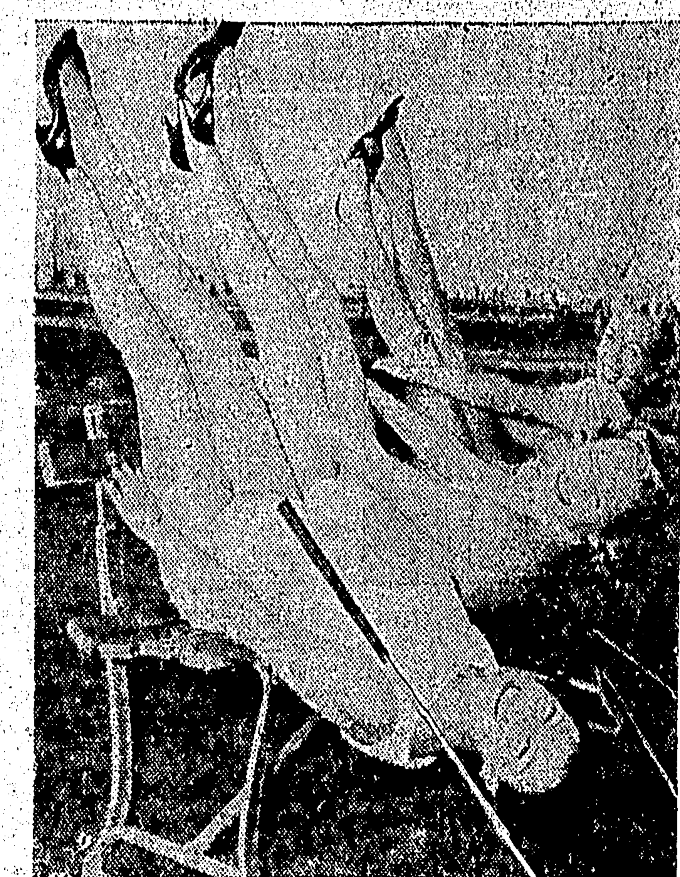
TEE-EASE — An unexpected hazard which might be expected to add quite a few strokes to the score of even the most expert golfer is this trio of beauties relaxing on the Desert Inn Country Club course in Las Vegas, Nevada.

Canadiens trail Detroit by five points, and Red Wings have a game in hand. Detroit is on the road for both weekend games, at Boston this afternoon in the televised encounter, and at New York Sunday. The other game has Toronto at Boston Sunday.