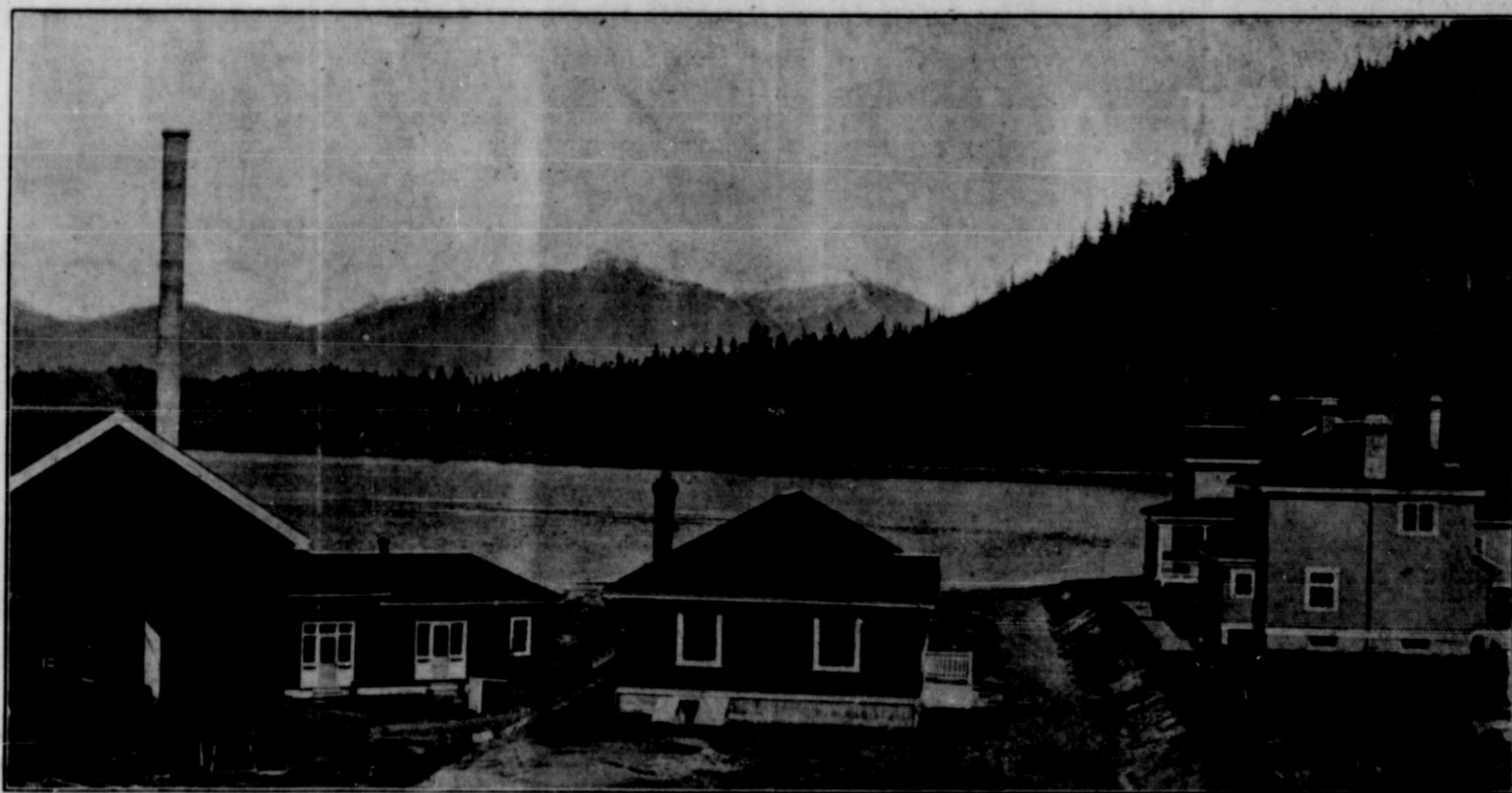
The Marine Station at Digby Island, now complete and in charge of Captain G. Saunders, Superintendent of Marine Works. On the site of these fine modern buildings strange ancient habitations were once erected by prehistoric men whose remains and traces have been discovered and are today in Prince Rupert.

Ottawa, July 18—A steady advance in prices continued in the June labor departments index number having increased to 37.9 in May. Previously the highest record of it was 136.9, compared with 126.1 in June last year. The chief increases in June are in animals and meats, fodders, fruits, and vegetables, hides and leathers, there having been a slight increase in dairy products, prepared fish, sugar, coal and coke.