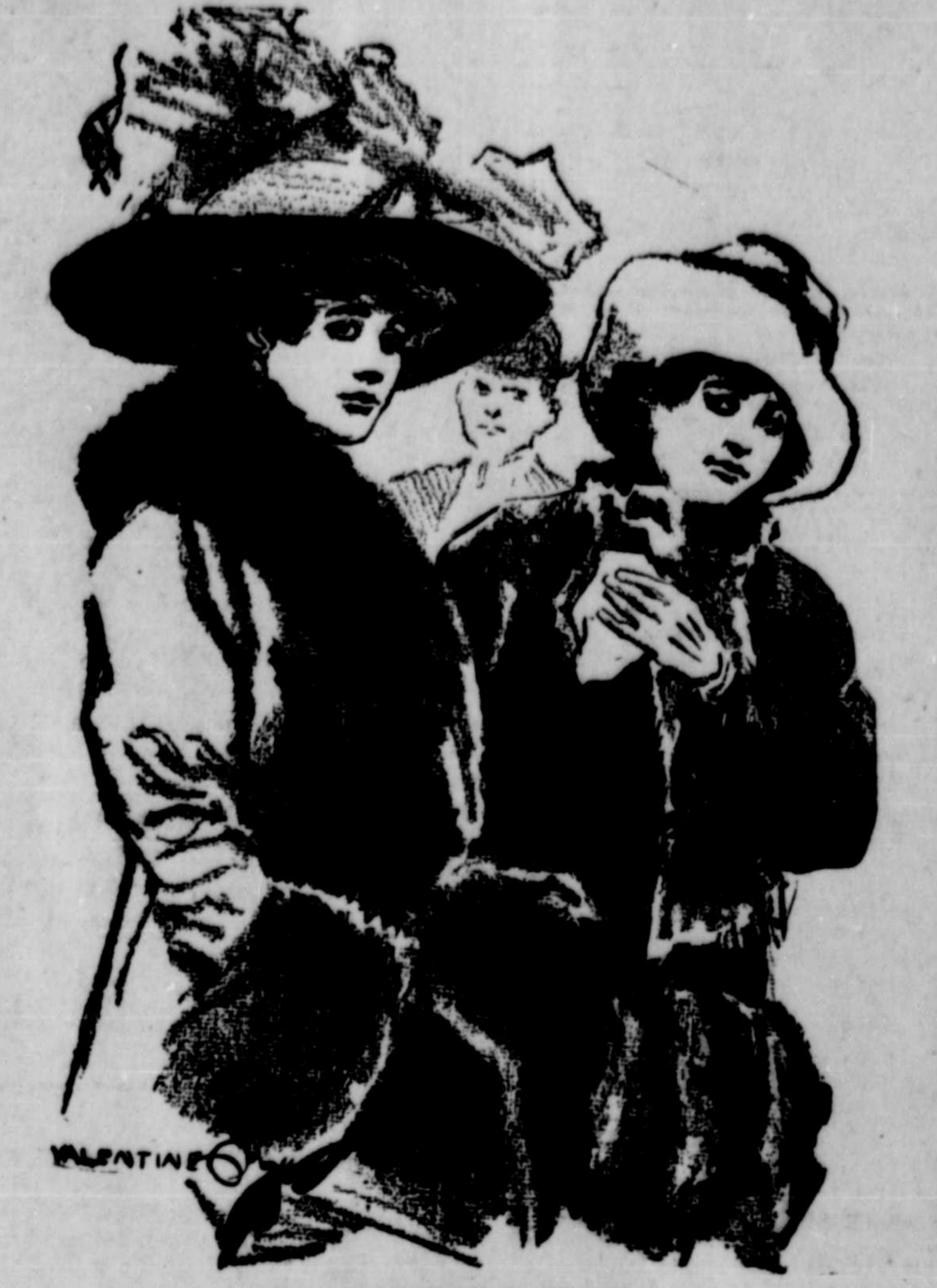
MATRIMONY AND MUSIC.