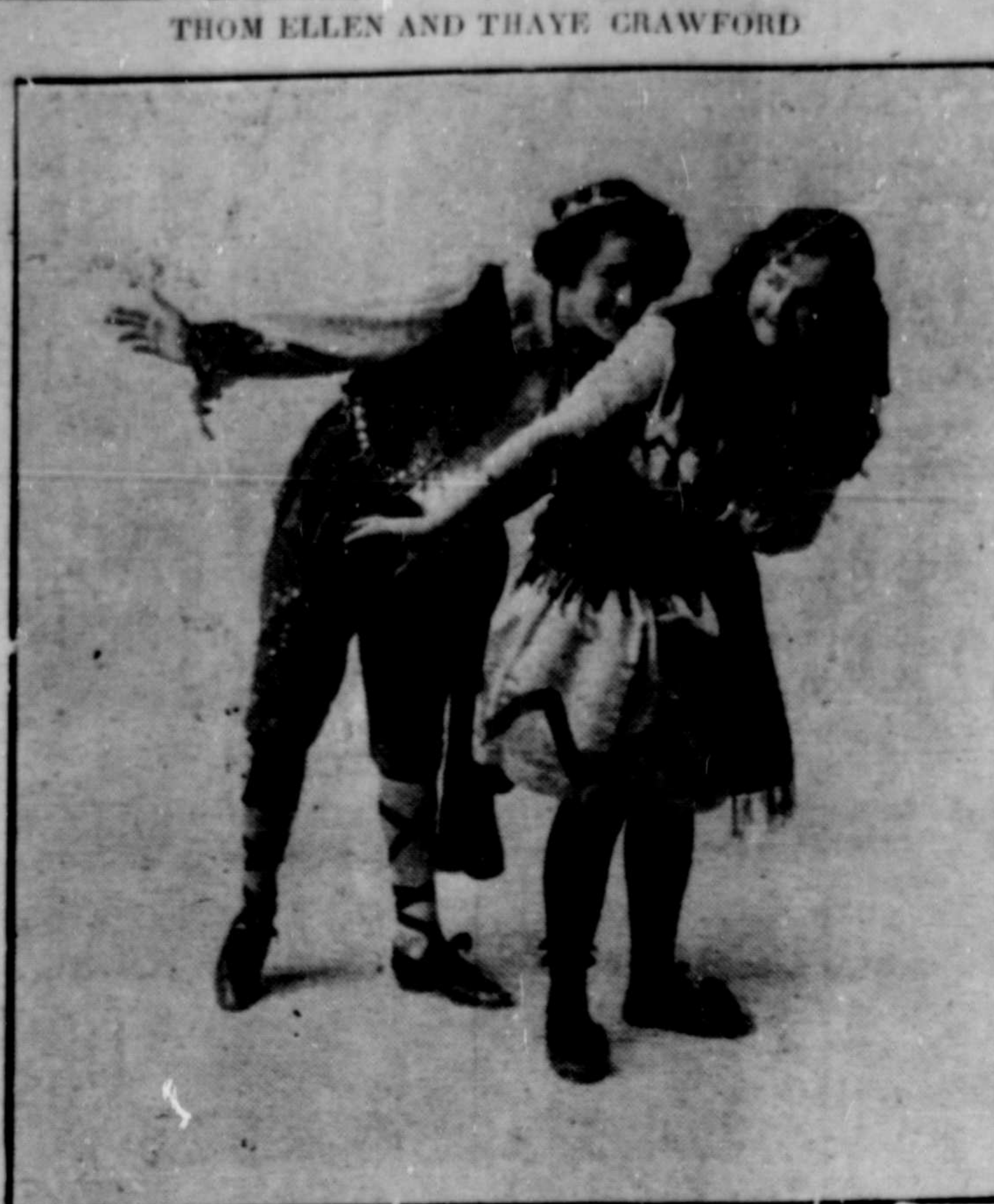
With the Juvenile Bostonians at the Westholme.

No matter how attractive a show comes to town nowadays the good old city hall vaudeville proves a fail-me-never, able to hold its own against all comers in the line of humorous time killing stunts. Last night a small audience at the city hall enjoyed comedy in real life almost as comical as the fare provided for the larger audience at the opera house. True, the harmony was lacking, likewise the feminine element, but the stage atmosphere is ever well to the fore in city halls where accusations of "playing to the gallery" and "monopolizing the spot light," "handing bouquets" and even "facing the music" are frequently applied. This morning those who preferred the city hall to the opera house are telling their friends that the local vaudeville lacked only the presence of the city band to make it as good as the best road show. The episode in which an applicant for consideration in connection with the city cleansing contract calmly usurped the seat of the chairman of the Board of Works and sat facing the Mayor to the consternation of the Finance Minister was only one of the evening's joys.