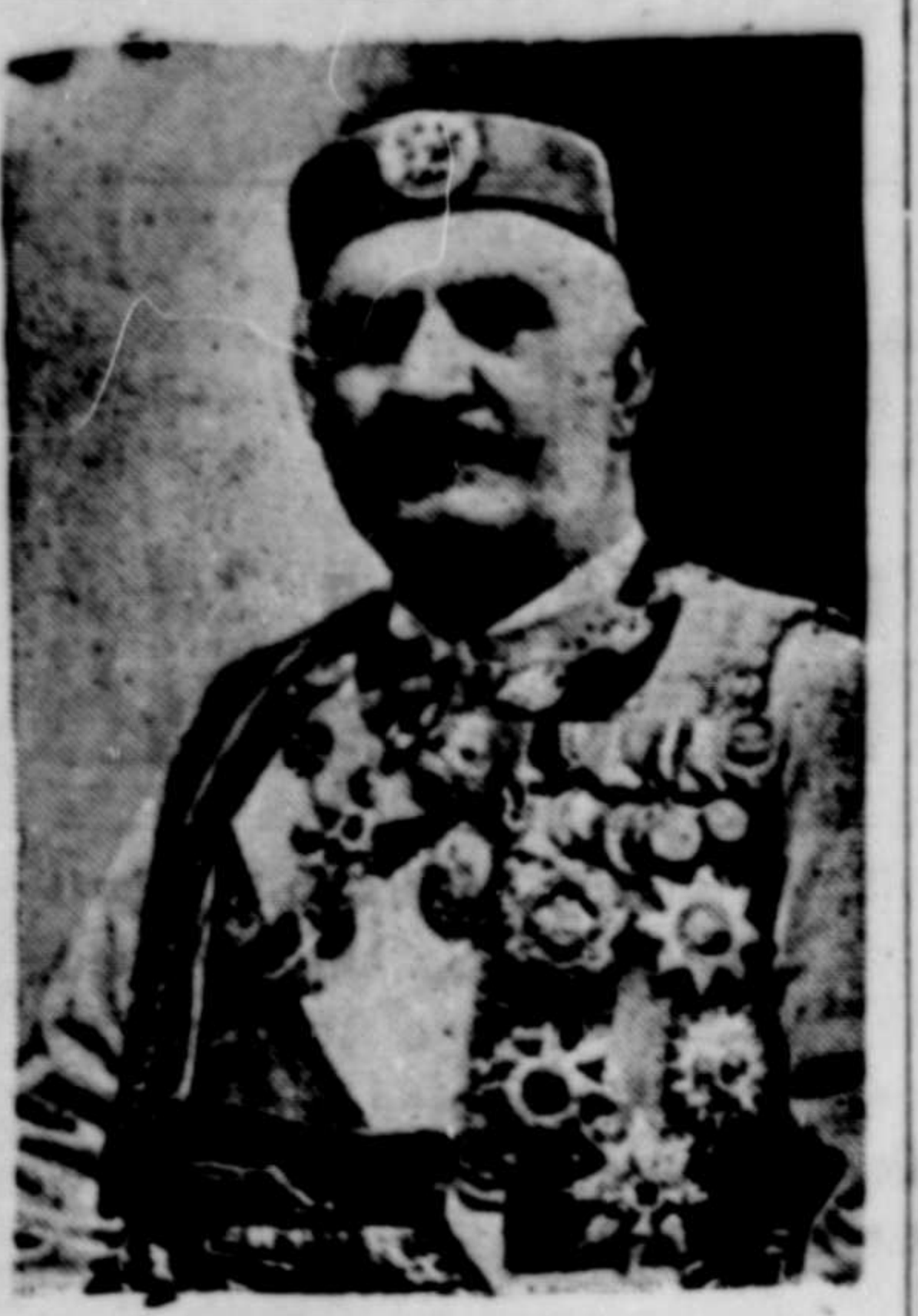
KING NICHOLAS of Montenegro.

Constantinople, Aug. 8.—Turkey today gave Montenegro 24 hours in which to explain Montenegrin activities on the Turkish frontier. Unless a satisfactory explanation is forthcoming Turkey will sever diplomatic relations at once, and the Turkish