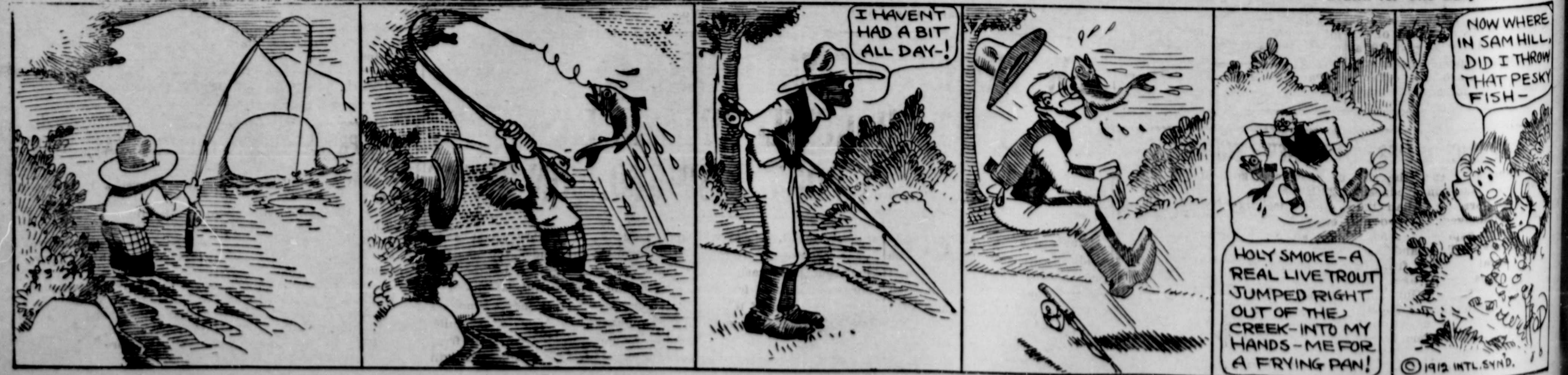
—Drawn for The Daily News by "Hot"