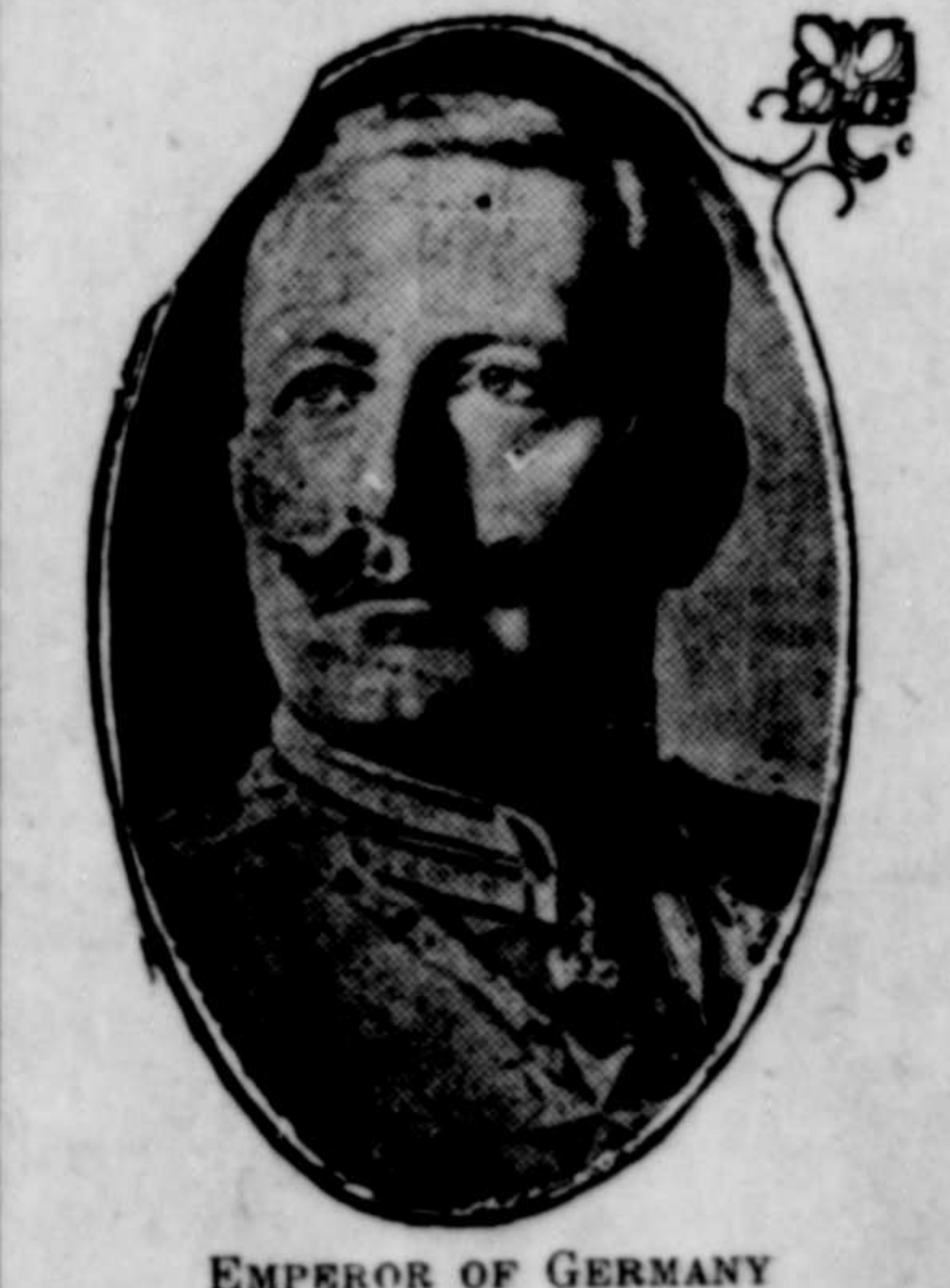
EMPEROR OF GERMANY