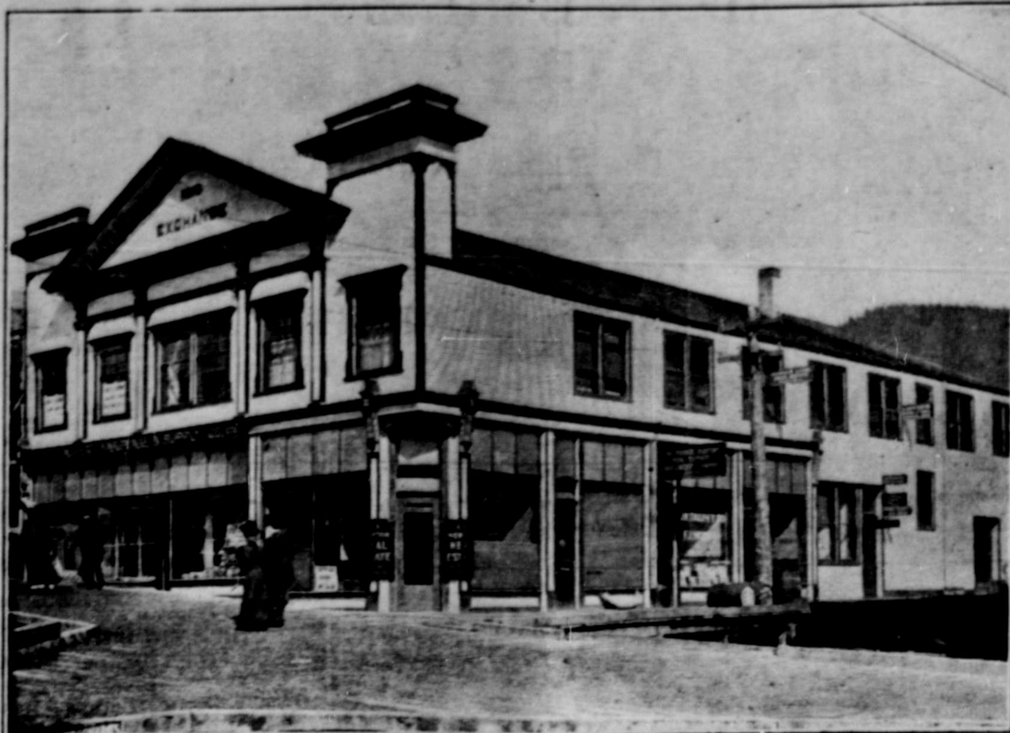
At Sixth Street and Third Avenue Crossing Where the Crowds do Congregate and Where the new Crossing Sweeper Brigade is Most Particularly Needed When It Rains

Canada imports much from the United States, and Prince Rupert particularly imports even a heavier proportionate amount than other centres. Reciprocity was refused by the people of Canada, though not by the people of Prince Rupert. It is still necessary to pay duty on articles you import, and to go through the Customs department routine, which protects the Dominion from the smuggler's nefarious trade. In Prince Rupert, accustomed as the citizens are to the lack of street cars and of various trouble saving luxuries, there is room for improvement even under existing customs conditions. The present Customs department arrangement necessitates the trotting of the hapless recipient of dutiable or even only imported and duty free goods first from the express office, where he finds the goods have been announced as arrived in Rupert; second to the customs house, where he signs a receipt for the goods, of which he has still not even seen the outside package, and third to the wharf customs office, where the parcel, big or small, is held until the uptown customs office clearance is presented for it. Not much to trouble about, perhaps, and the customs house officials in both offices are polite and obliging as can be. But still, mightn't there be some plan for transferring the small packages at least, which are subject to customs regulations, to one central office where the consignee could pay the charges and get the goods delivered without need for further travel?