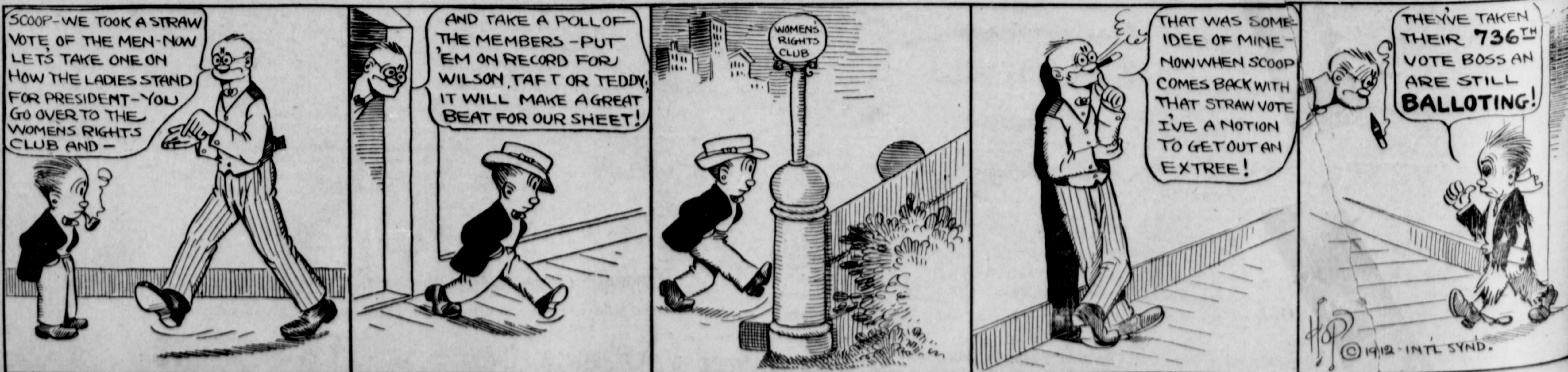
—Drawn for The Daily News by "Hop"