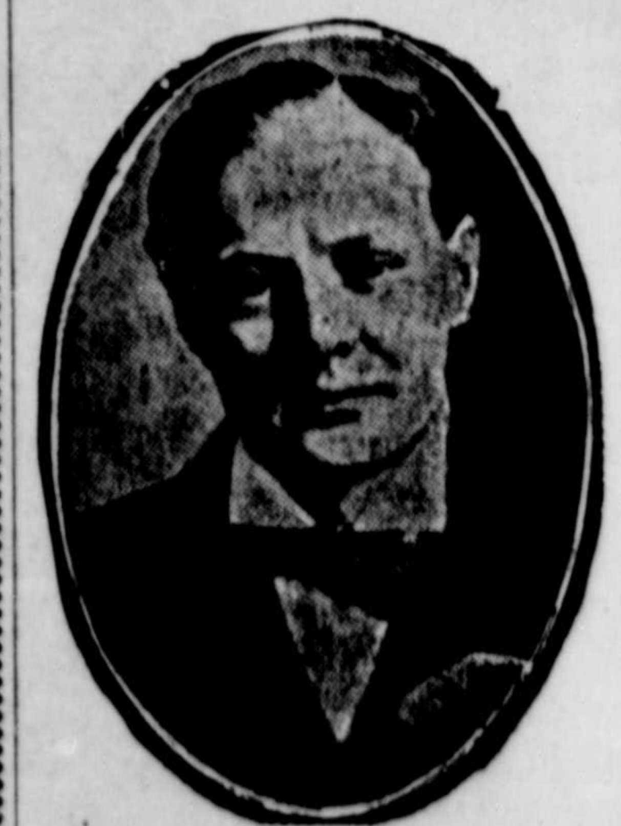
HON. WINSTON CHURCHILL.

London, Oct. 9.—Winston Churchill is expected to make an announcement at an important