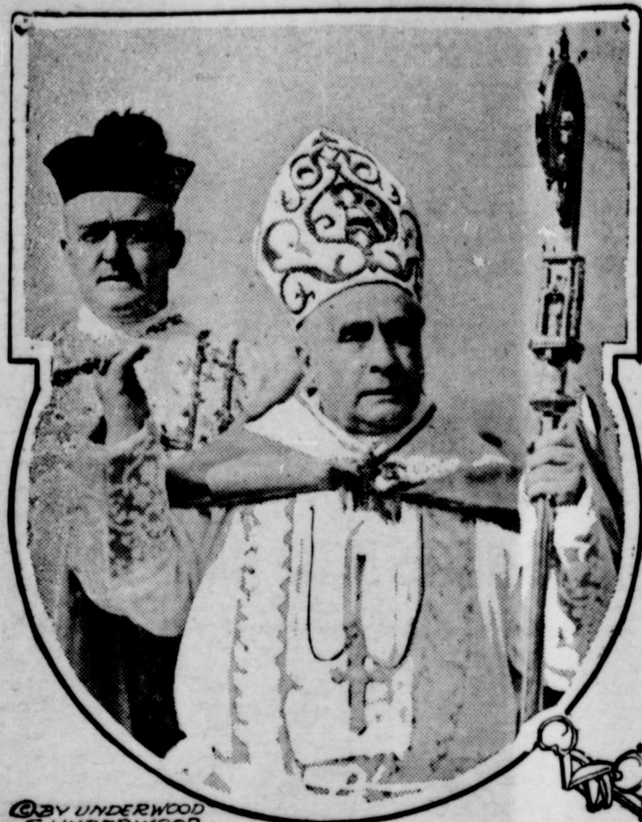
HIS EMINENCE JOHN CARDINAL FARLEY

This is his first visit to the western half of the United States, and although travelling in a strictly private fashion, without attaching any official significance to his visit, the head of the Catholic Church in America insisted on giving his message to the State, which had hidden him