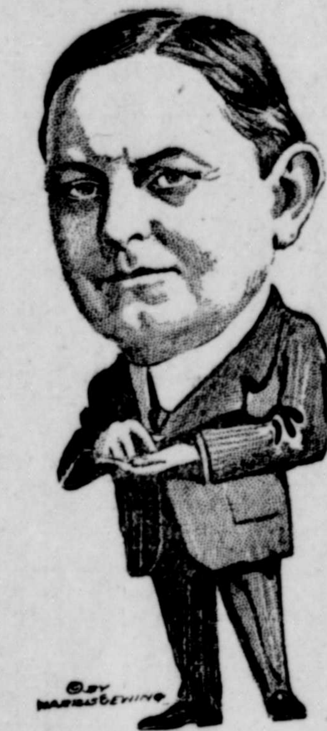
OSCAR W. UNDERWOOD Leader of Democrats in U. S. House of Representatives, which assembled last week.

The whole attitude of the administration since its advent to power has been one of hesi- tation and timidity, and no better proof of Mr. Borden's abject fear of the people could be given than his refusal to grant the increased representa- tion called for by the census. This fear is responsible for the feebleness shown by the viola- tion of his pre-election pledge. —Vancouver Sun.