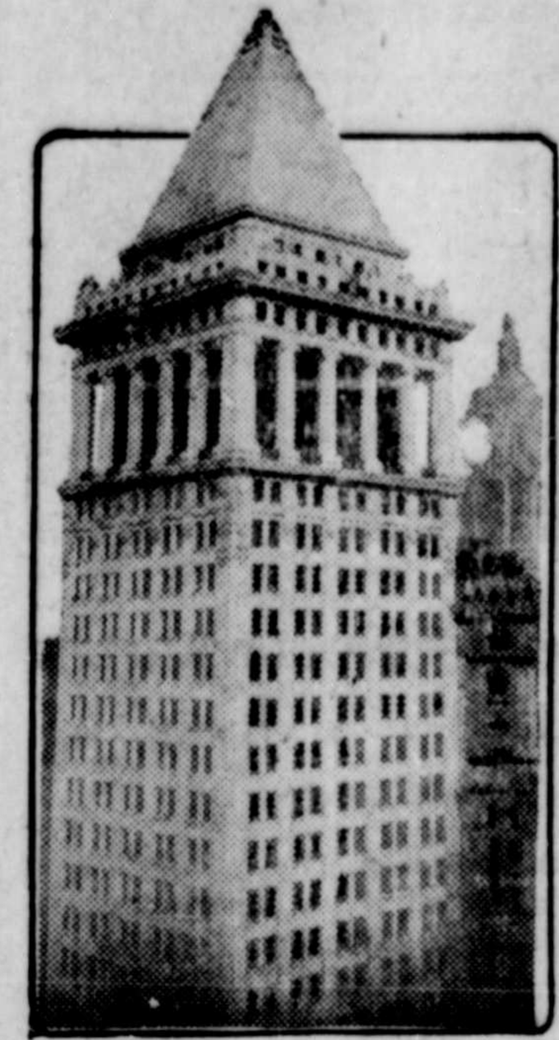
MORGAN'S STOREHOUSE. New Bank of Commerce Building, New York, where Morgan keeps his millions.

Washington, Dec. 24.—J. Pierpont Morgan told the money trust investigation committee of the House that "all the money in Christendom and all the banks in Christendom" could not form a monopoly that would control money. Mr. Morgan disclaimed any knowledge that he wielded a vast power in modern finance and