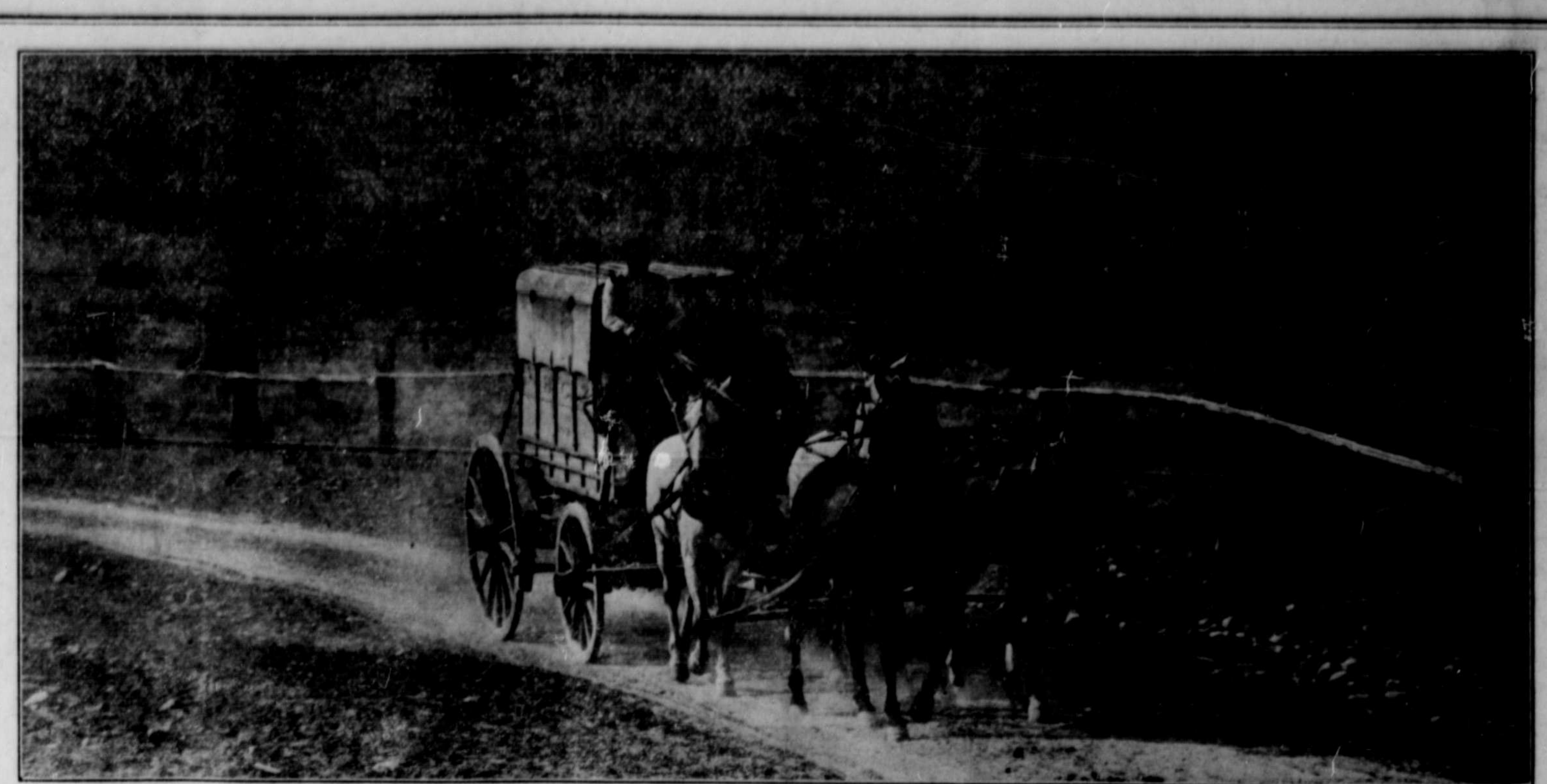
A HISTORY MAKER—One of the stage coaches, now disappearing before the advance of the railroads, which until this year, was the only means of land transportation to Hazelton.

Skeena Land District—District of Coast, Range V. Take notice that William J. Mooridge, of Vancouver, B. C., occupation broker, intends to apply for permission to lease the following described lands: Commencing at a post planted on the shore in a small bay about one-half mile north of entrance to Kumeolon Inlet, on Lot No. 187, thence east 20 chains, thence south 20 chains, thence west 20 chains, thence north 20 chains, thence east 20 chains, thence north 20 chains, thence west 20 chains to point of commencement, containing 60 acres more or less.