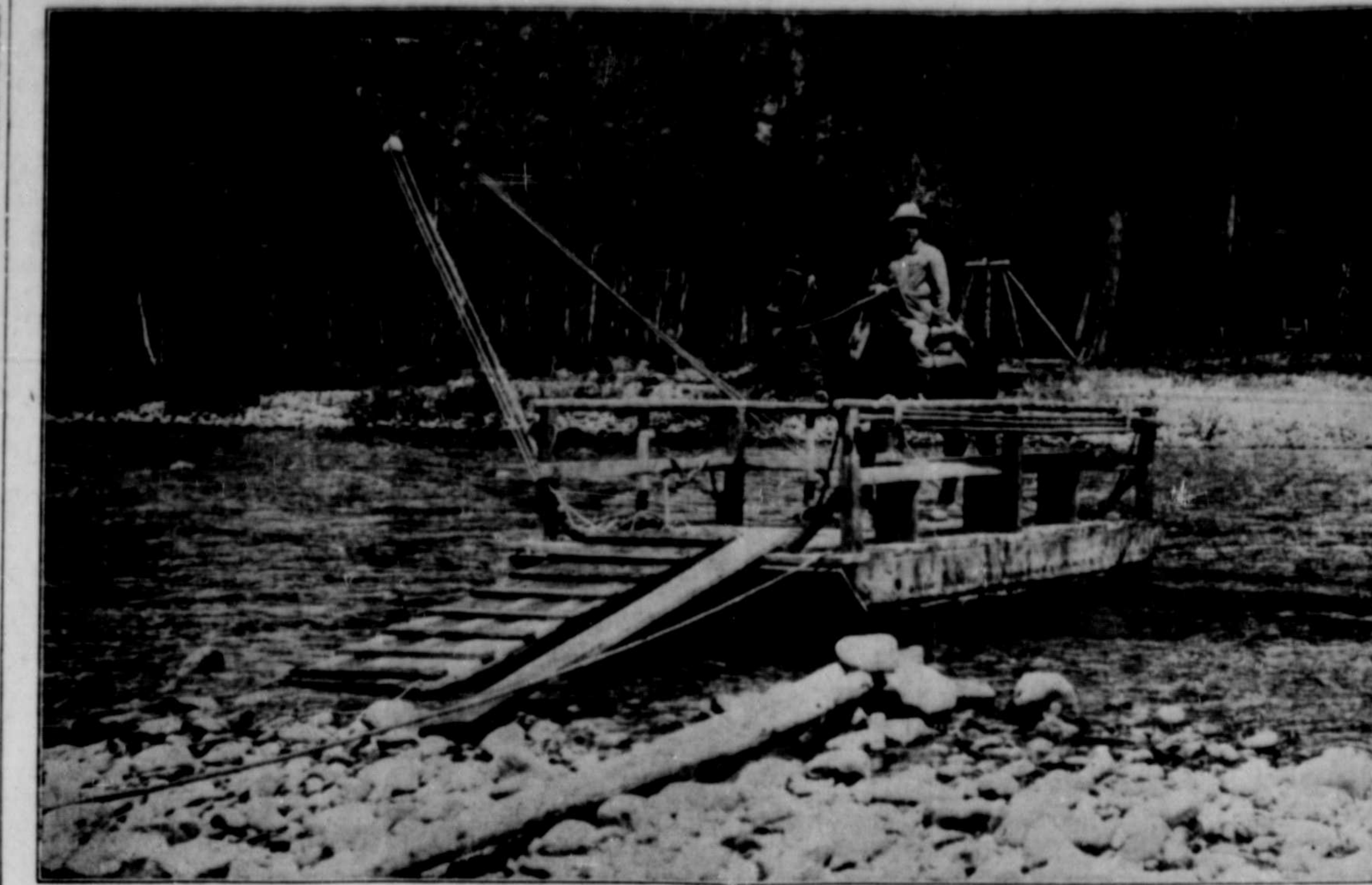
FERRY OVER THE BULKLEY RIVER

If that is the effect of the contribution policy even when it is in the paper stage, what may the ultimate outcome be when divisions of opinion arise as to the amount of the contributions and charges are handed back and forth that the dominions are not doing their share or that the Mother Country expects too much? Is the fact not apparent already that there is only one safe path to follow if the cordial relations that have so long obtained are to continue?—Victoria Times.