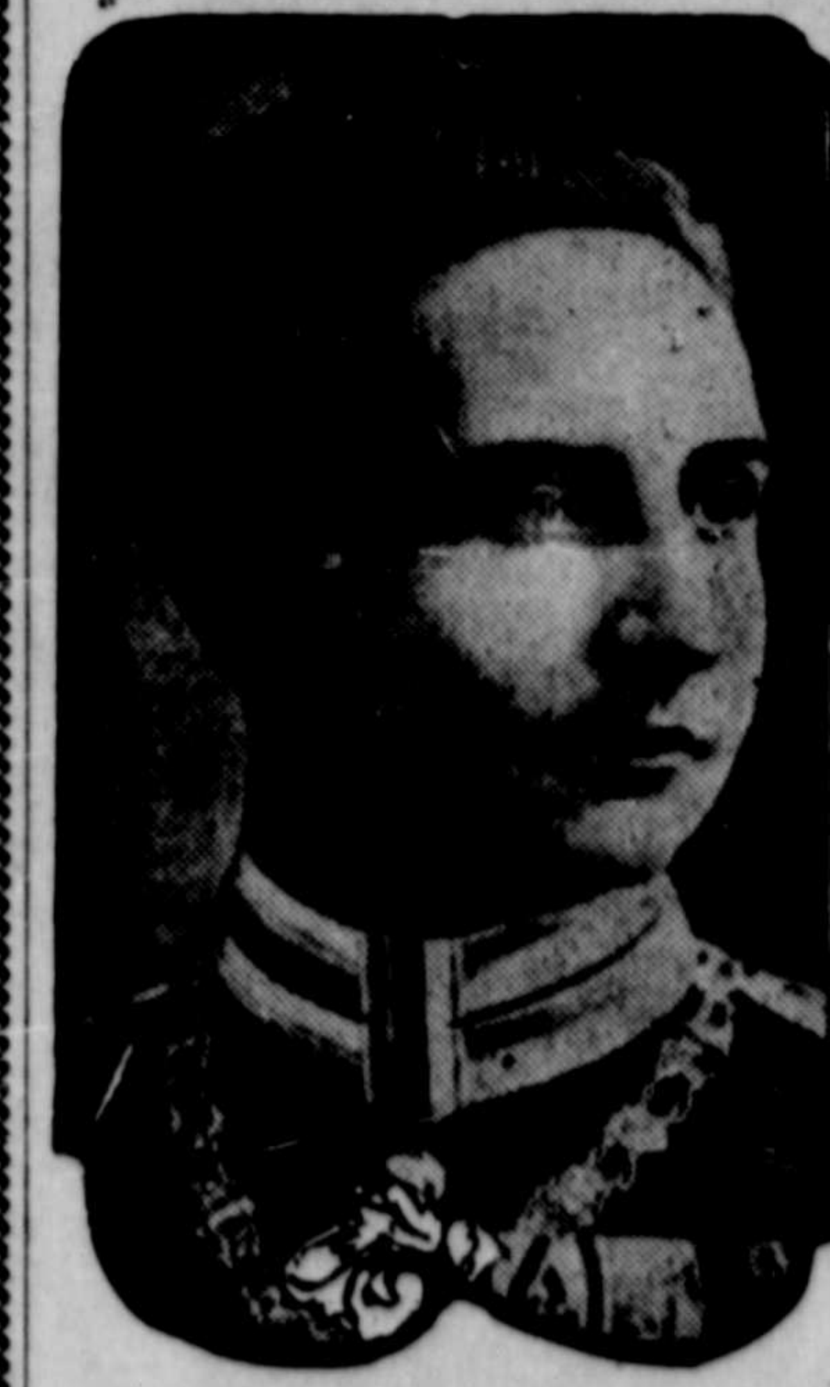
PRINCE AUGUST WILHELM