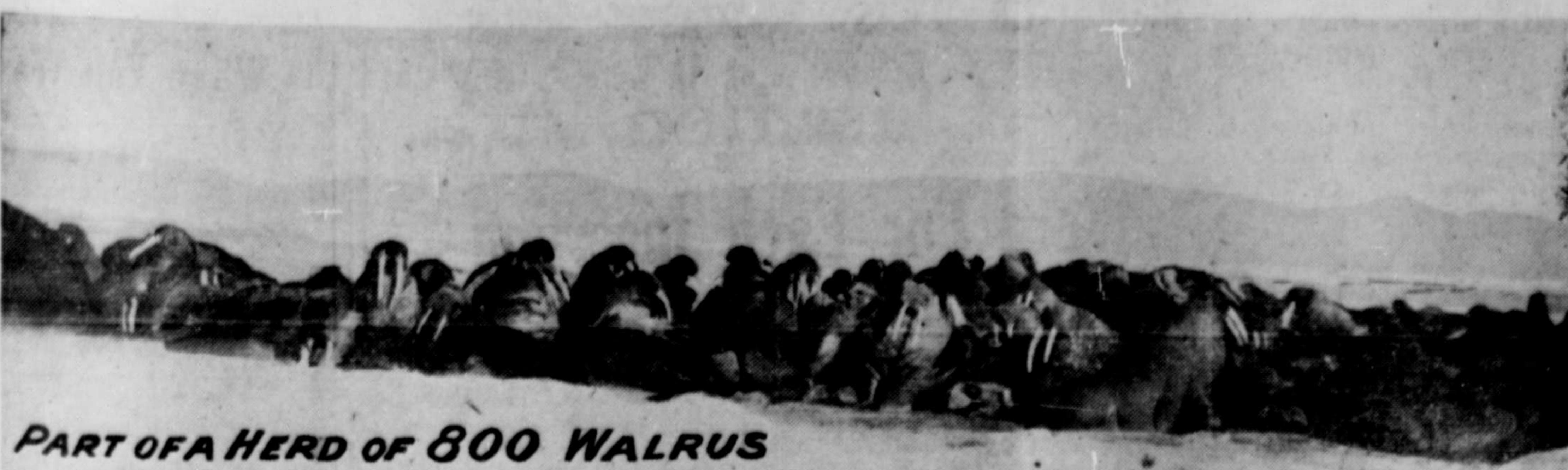
PART OF A HERD OF 800 WALRUS