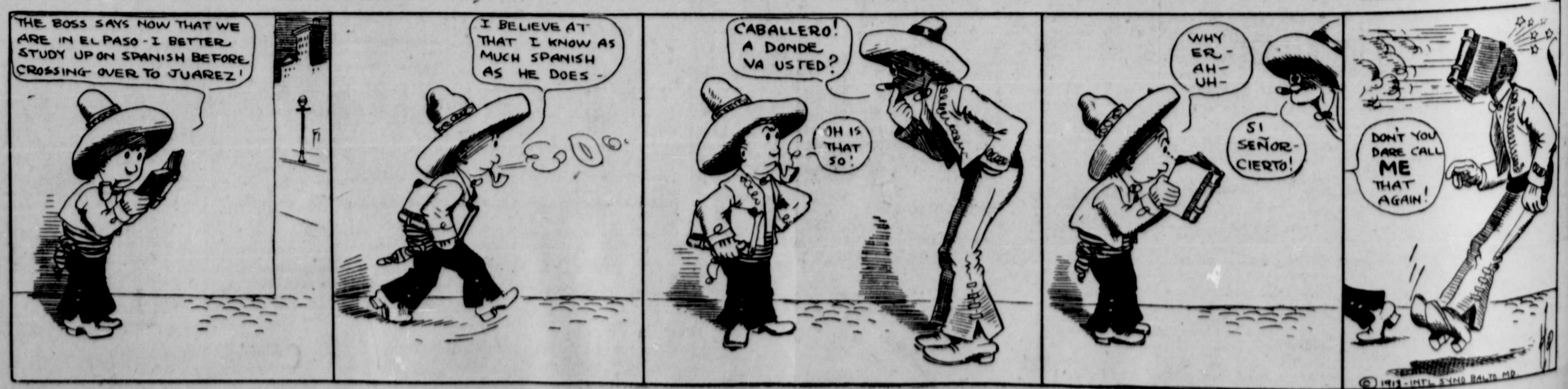
Drawn for The Daily News by "Bo"