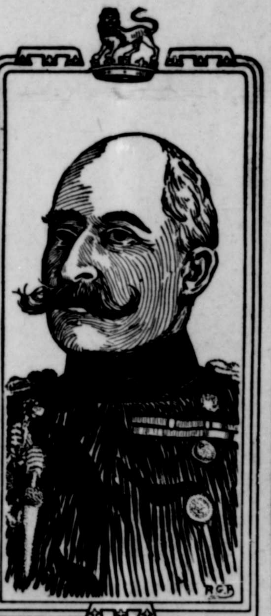
H. R. H. DUKE OF CONNAUGHT.

London, May 2—Yesterday Windsor was en fete. It was the birthday of the Duke of Connaught, brother of the late King