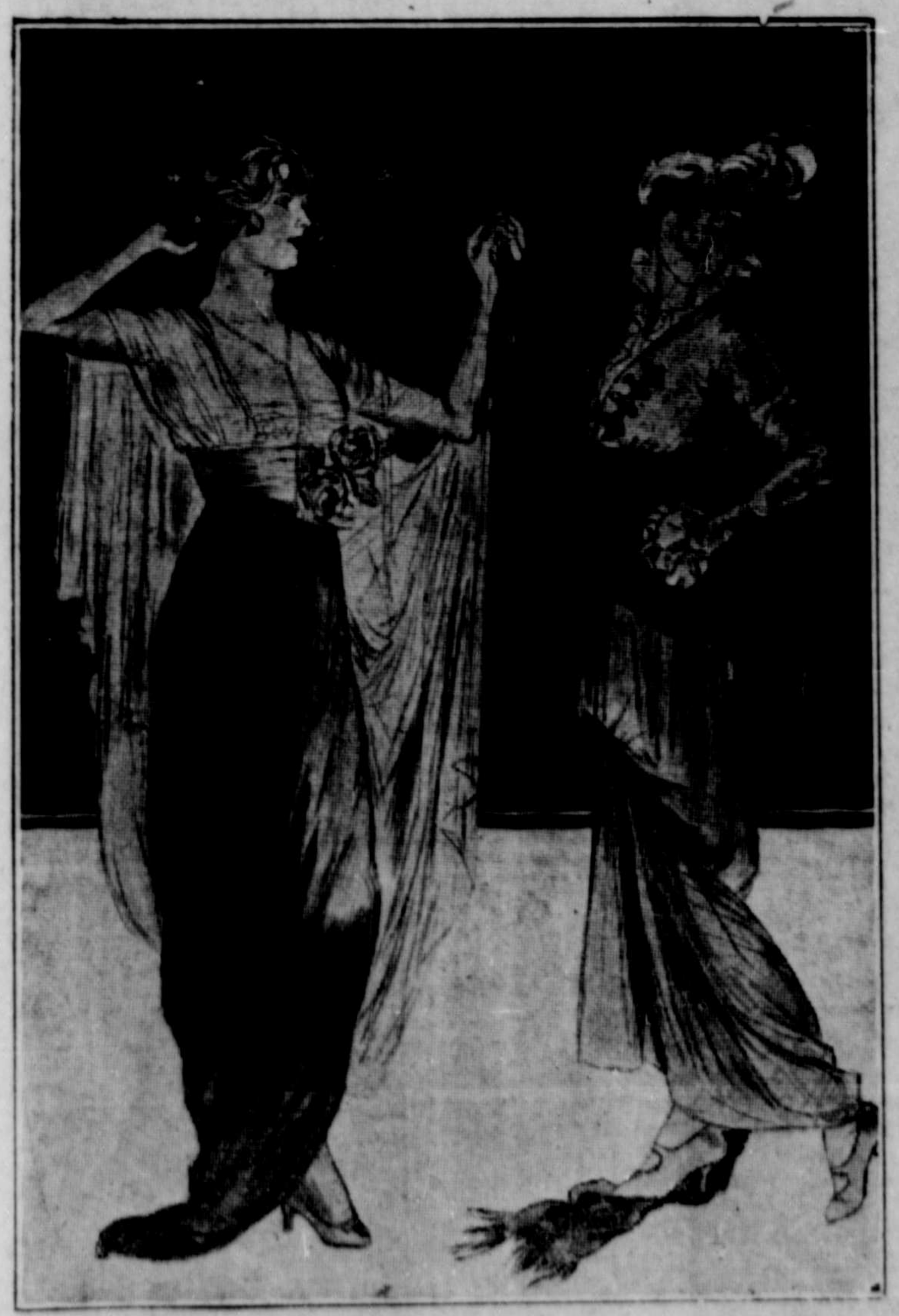
SCARF, SASH AND MEDICI COLLAR—THREE NOTES OF THE PRESENT FASHION.

A distinctive feature in the new fashion is the vogue of the Medici collar, which is carried out in lace or tulle, and makes a becoming frame for the face, as is shown in the right hand figure of the picture.