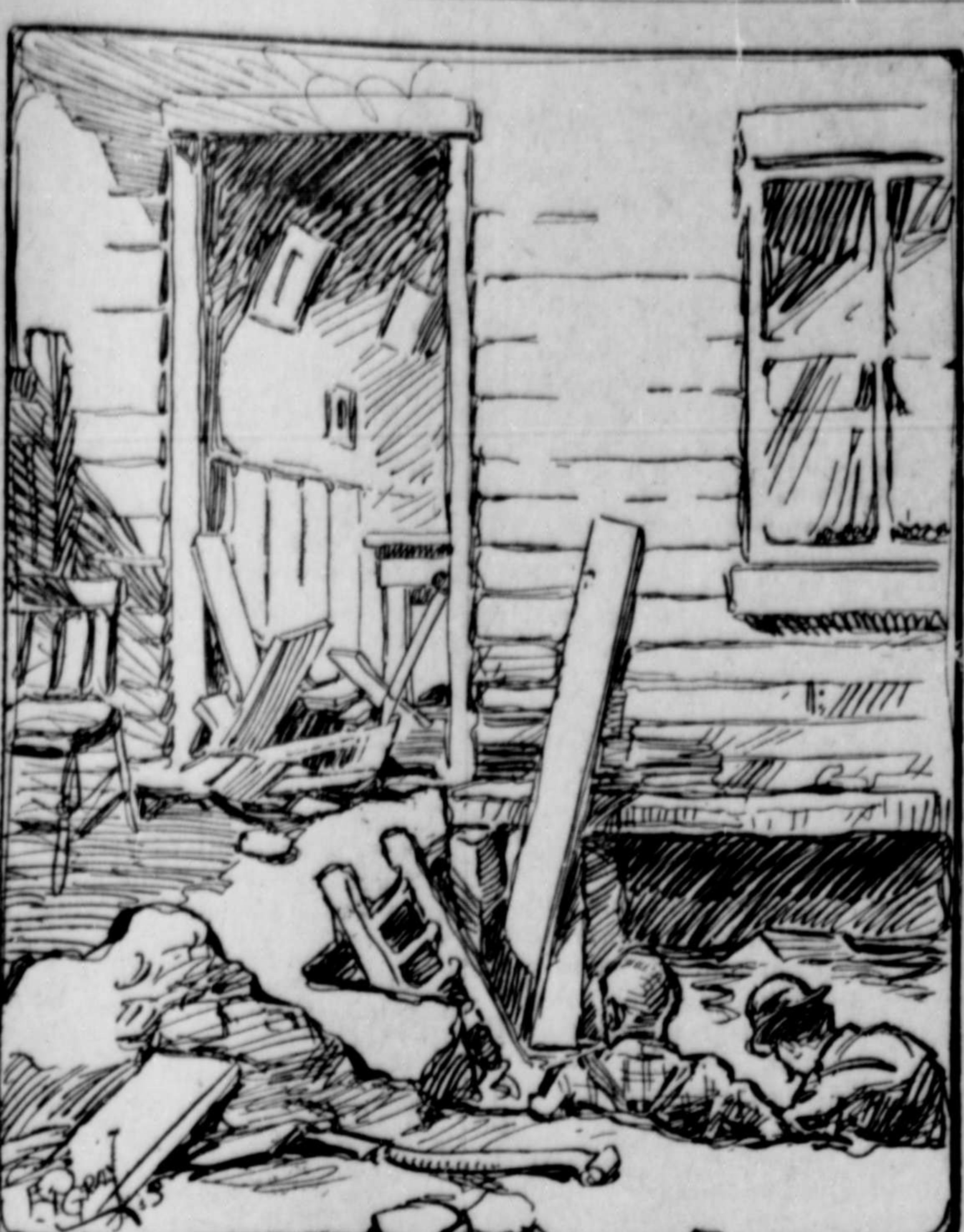
SEARCH FOR BODY OF MISSING PENSIONER.

Water Notice. For a license to take and use water. Notice is hereby given that The Prince Rupert Hydro-Electric Company, Limited, of Prince Rupert, B. C., will apply for a license to take and use 50 cubic feet per second of water out of Madeline Creek, which flows in an easterly direction through Crown lands, and empties into the Skeena River about 15 miles from its mouth on the south bank.