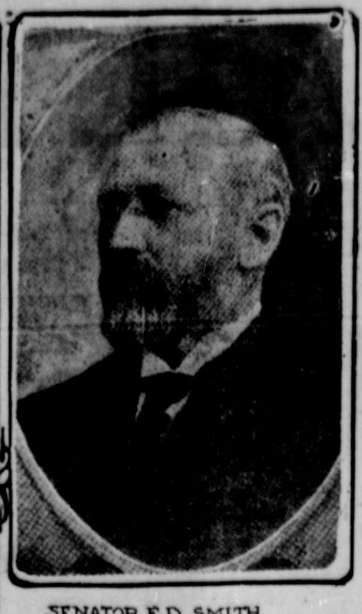
SENATOR E.D. SMITH