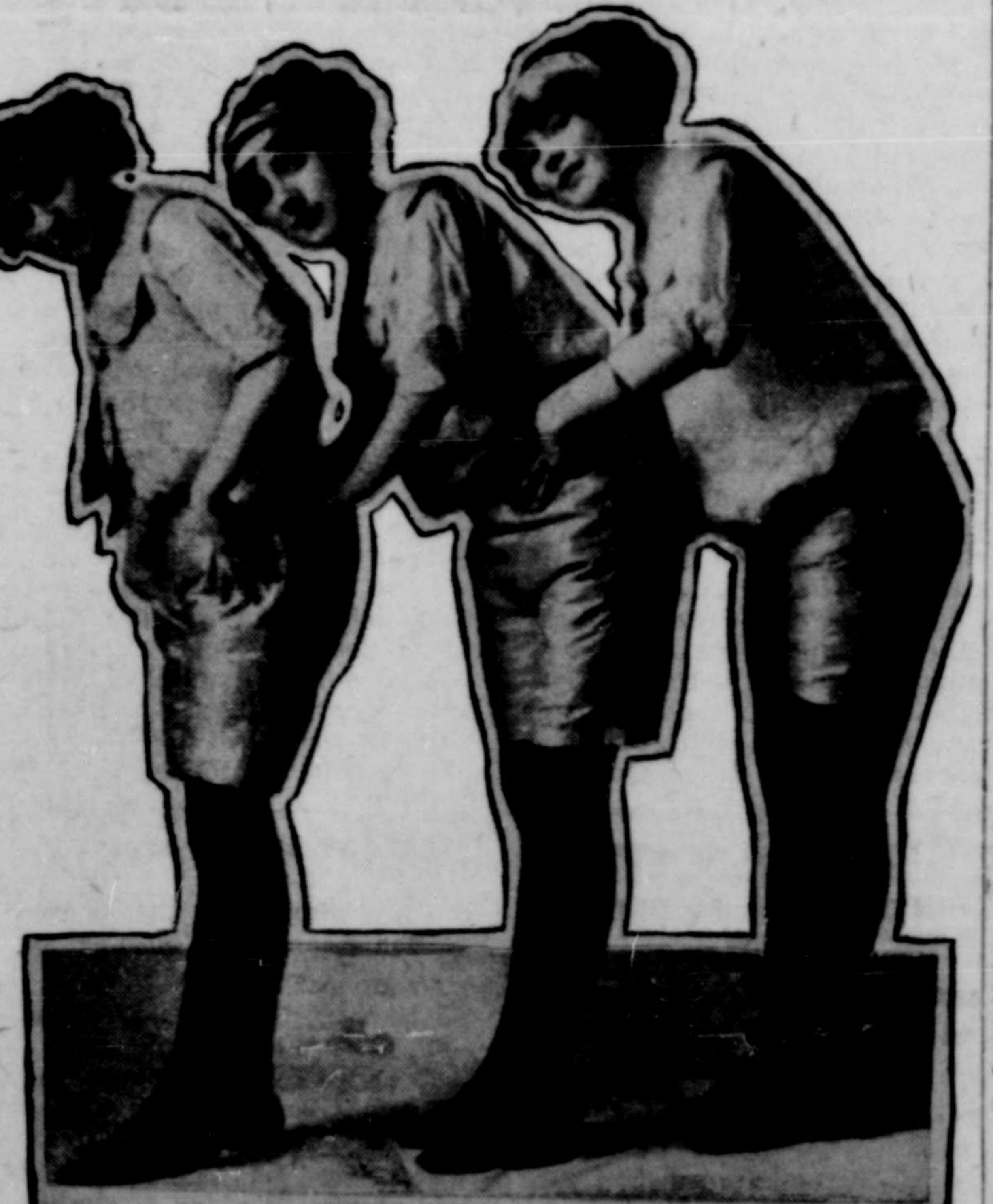
SUNSHINE GIRLS In Peek-Inn at the Westholme Opera House Tonight