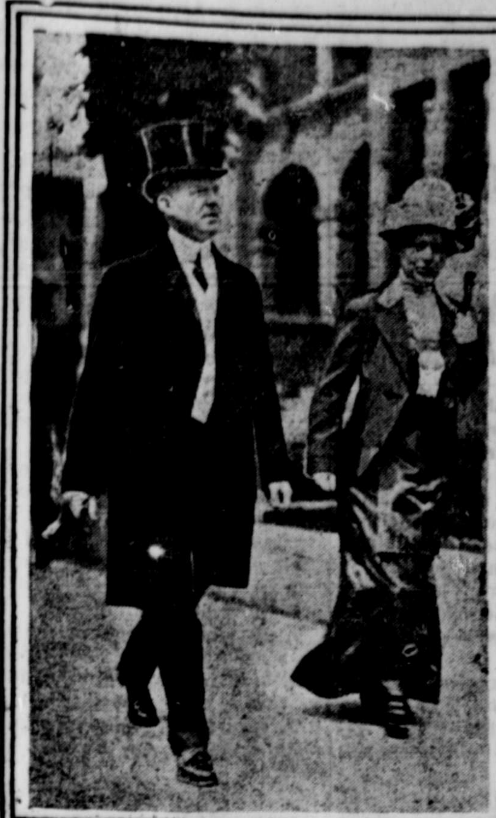
MR. MACDONALD WESTMINSTER PRESS.

WATER NOTICE. For a License to Take and Use Water. Notice is hereby given that the Prince Rupert Hydro-Electric Company, Limited, of Prince Rupert, B. C., will apply for a license to take and use 50 cubic feet per second of water out of Madeline Creek, which flows in an easterly direction through Crown lands, and empties into Hecetai River about 15 miles from its mouth on the south bank. The water will be diverted at unnamed falls about one mile from mouth of creek, and will be used for generating electric power purposes for sale, barter or exchange within a radius of 100 miles.