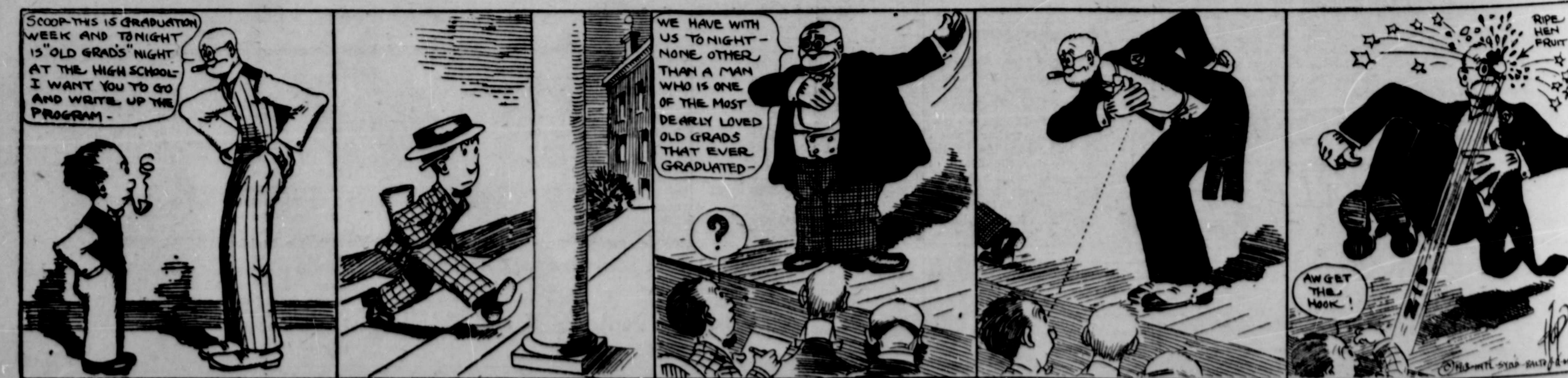
Drawn for The Daily News by "Hop"