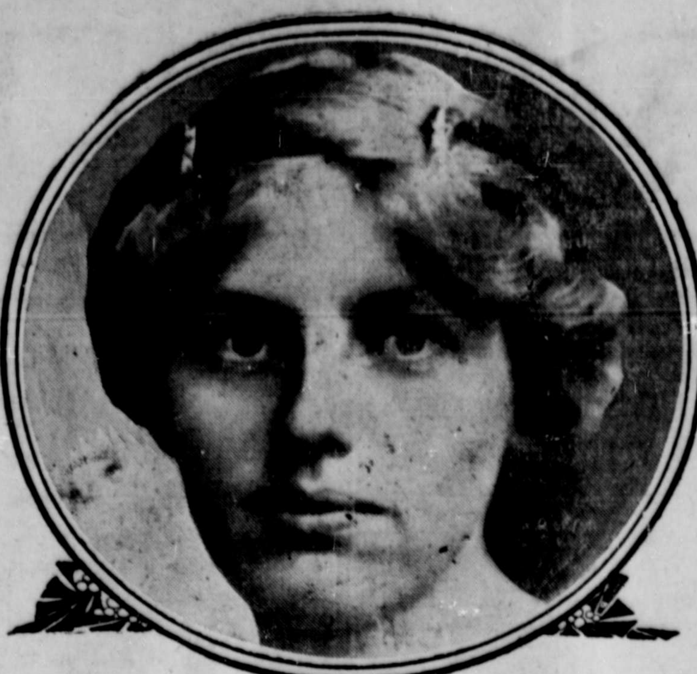
DAUGHTER OF THE AMERICAN PRESIDENT

Yet even if we admit all this, and speak of Japan no longer as in the Near East, but as in the Farthest West, the problem of their immigration into these countries still remains unsolved. For the present, thanks to the Lemieux agreement, it is not an acute problem with us. Let us hope that it will remain so for some time to come and leave us all our energies to undertake the great tasks of developing the wealth of this great province.